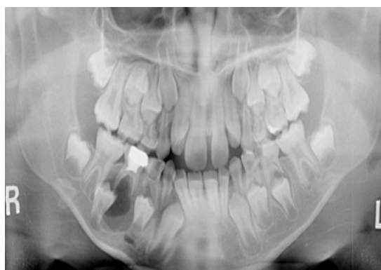
Figure 1: Panoramic radiography showed huge radiolucency under lower right deciduous molars.

Panoramic radiography and computed tomography had been taken for all cases, showed a huge radiolucency under the deciduous molars (Figures 1 and 2). Premolar tooth buds are involved in radiolucent area and the path of eruption has been redirected in all cases. Based on the medical history, clinical and radiological examination, a preliminary diagnosis of the radicular cyst was made and the medical history was continued without significance.