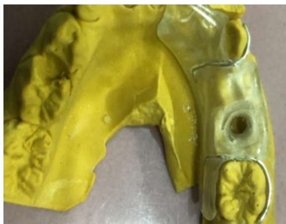
Figure 3: The design features multipurpose space maintainer.

The gauze was allowed to stand for 2 days after which an alginate impression was made and an acrylic obturator was fabricated. The design features included an acrylic plate with centric fenestration with a posterior stainless steel clasps on the right first permanent molar and anterior lingual plate (Figure 3).