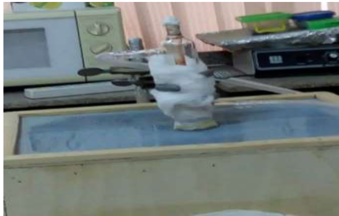
Fig. (1): feeder membrane equipment

Feeder membrane (Fig. 1) consists of two tubes, the first one for positive blood meal surrounded with the second one for the current water which connected with the water bath at 37 °C to keep the blood temperature. The 1 st tube with two ends, the bottom, covered with chick membrane and the upper covered with a piece of cotton after a blood meal entered. The 2 nd tube with two ends also, for income and outcome of the current water.