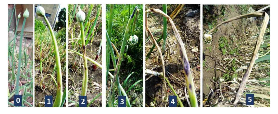
Fig 2. Flower stalk infection (0-5) scale

The formula to calculate percentage of DS used by Wheeler (1969) followed: