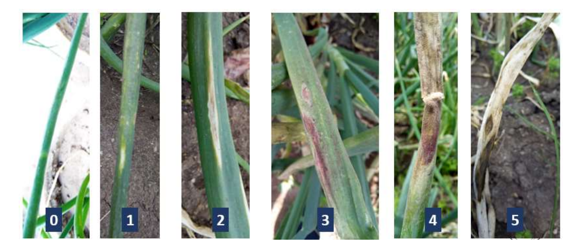
Fig 1. Leaf area infection (0-5) scale