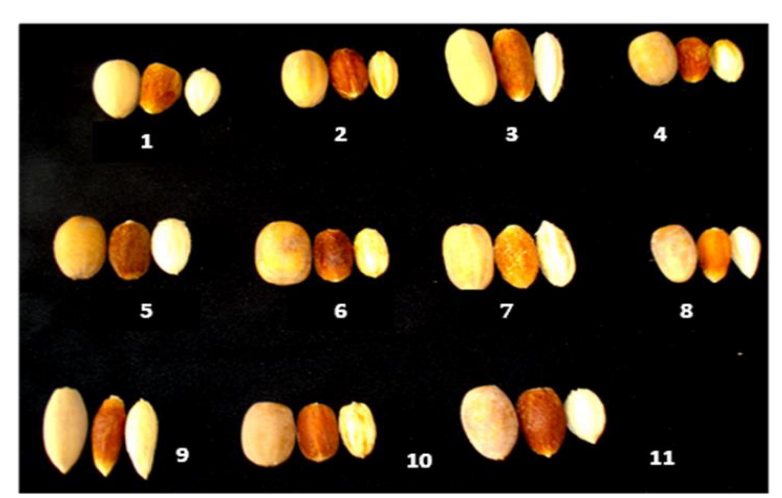
Fig. 1. Morphological differences of fruits and kernels in eleven individuals of B. aegyptiaca