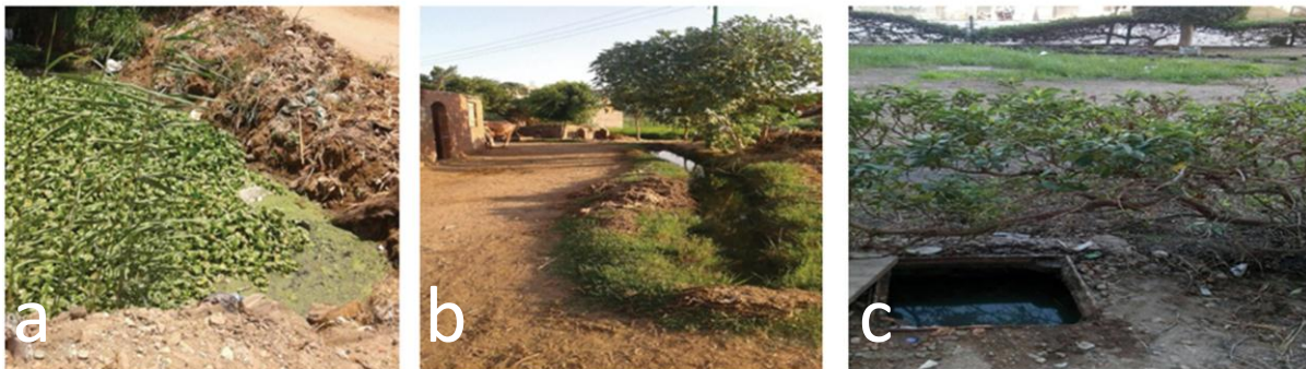
Figure 2: Landscape photographs of surveyed mosquito habitats: (a) Al-Beshlawy drainage canal in a rural agricultural area of Abu Rawash, (b) El-Khartoum irrigation ditch in a rural settlement area, (c) an urban man-made ground hole near Tanta University campus.

The convention campus of Tanta University site is located in the centre of Tanta City, Gharbia Governorate. This area is an urban site that encompasses various sectors of workforces including shops, restaurants, hospitals service, and faculties. Mosquito samples were collected from a stagnant man-made ground hole near to Faculty of Science (located 30°48'5.339"N latitude and 30°59'36.114"E longitude) with a width of 1.0 m and depth of 1.0 m. It contains rain and drainage water (Figure 2C).