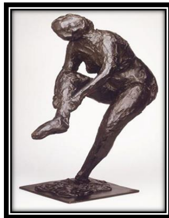
Work's name: A dancer wearing a sock. Material: bronze