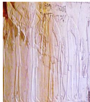
Dancers perform some dances at the Lion Love Festival One of the inscriptions from The Khreyouv Cemetery in Assasif