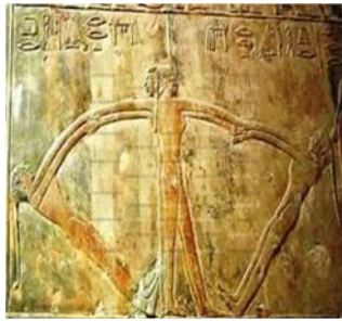
Girls dancing the ring dance in the old country http://www.historyforkids.org/learn/egypt/games