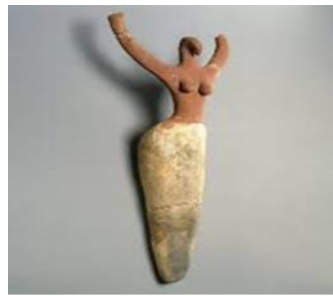
Naqadah's first dance statue around 3500-4500 B.C. is a ritual and religious rites of the mother goddess, bringing fertility and reproduction, it is a small head with her arms raised to the height of 29cm colored pottery found at the Brooklyn Museum in the United States.