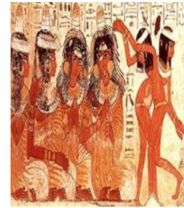
Dancing at the Pharaohs is a religious and worldly ritual. http://en.wikipedia.org/wiki/tomb_of_Nebamun