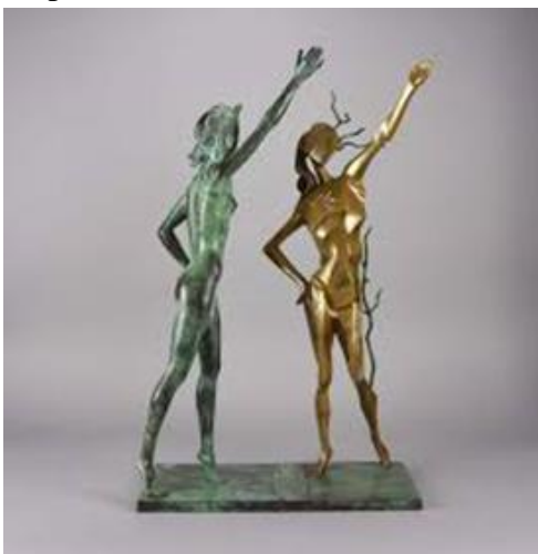
Artist: Salvador Dali

The sculptor sought to extrapolate the movement through the cognitive path of vision, so the movement here is within the structure of the sculptural form and this is what we see through the folds in the form as well as the sculptural lines at the bottom of the sculpture. It makes us stand in front of a human action, or in front of a vision, thought and message that addresses the recipient with a purely appealing aesthetic message, and a creative vision that emphasizes the content and the message of the presented artwork.