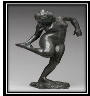
Work's name: A dancer looks down on her right foot. Material: bronze