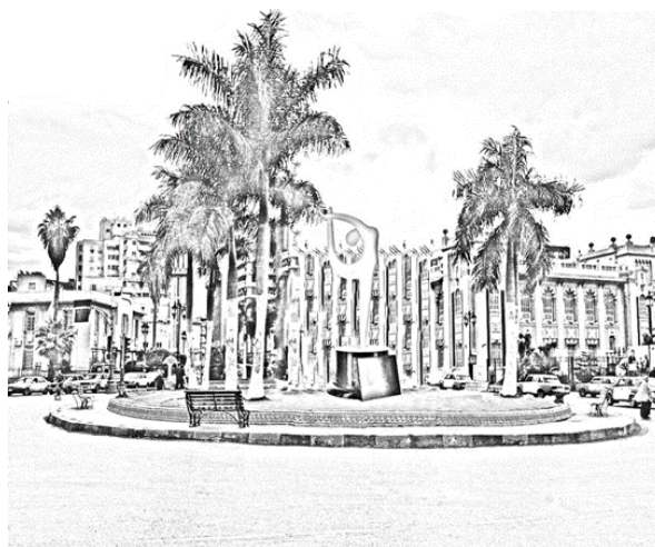
An imaginary suggestion for the square from the researcher