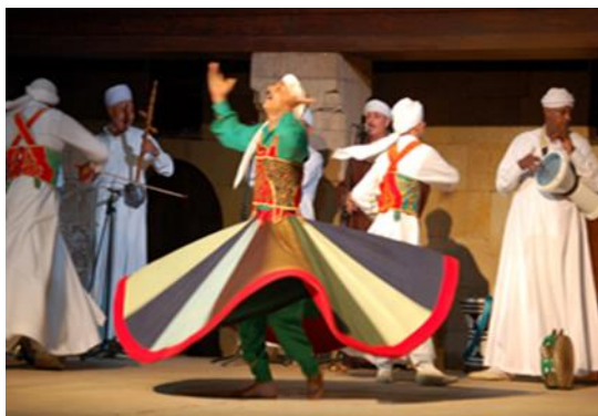
Sufi Dance in Egypt https://www.google.com/search