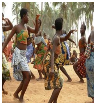
African dance between body language and the necessity of inspiration http://bit.ly/1OKr5wf