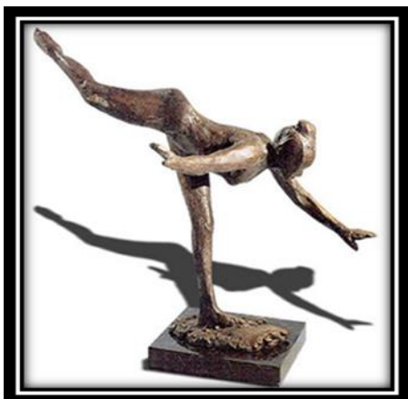
Work's name: Ballerina Material: Bronze