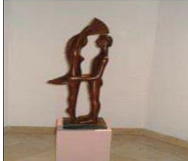
Ballet Dancers by Alsayed Abdo Selim 1998, 120cm.

The sculptor Alsayed Abdo Selim (1952) also displayed one statue of a ballet dancer in which he presented dancers (man and woman) about the epic fantasy in Egyptian legends circulating in villages and countryside. However, he was able to express the still balance in his work and this was in a moment of poetry between the dancer and the ballerina. This depends on the cancellation of the features of the dancers, the refinement of the bronze surface and the cohesion of the mass of the dancer and the ballerina separately and their connection through the arms of the dancer who touches the center of the ballerina as if waiting for the dancer's signal. Also, the sculptor Kamal Obaid (1918-2002) presented the dance of the wedding as part of his dance of folk dance.