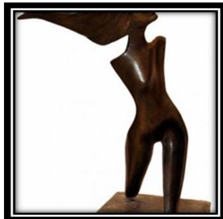
Artist: Mohammed RizkRaw: Work's name: A forward-looking dancer with features. Material: Copper Casting