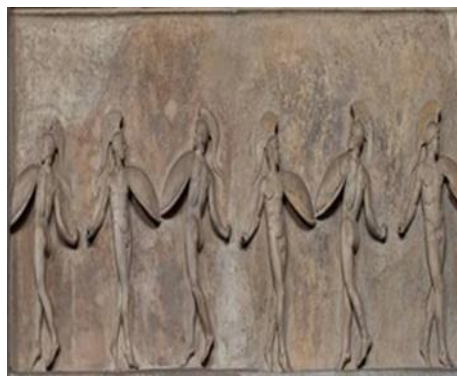
Greek military dance, prominent pits on marble