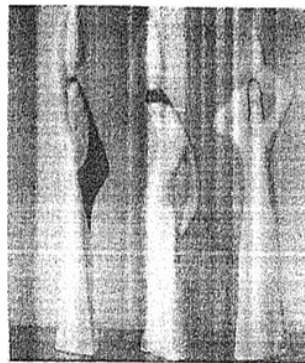
Dancers by Hassan Hashmat, 17 cm ceramic sculpture 1964, Hassan Hashmat Museum

When referring to the ceramic sculpture sought by Hassan Heshmat (1920-2006), which is the art of studies and research attached to the art of ceramics and united the stylistic properties of the language of ancient sculpture and simply the natural perception of contemporary artists. This artist has one continuous line and was an extended mountain in drawing the human personality of the dancing peasants, and we confirm the lack of fabrication in the movements of women as they fill jars from canal water. Hasan Hashmat presented the dancers in distinct and varied ceramic forms in terms of composition and plastic treatment, and thus tends to a kind of mosaic decoration.