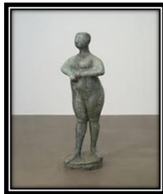
The full-bodied dancer - bronze - Multicolored 174cm - 1949 William Lembork Museum

Italian sculptor Marino Marini creates sculptures in an abstract organic structure and adds to it his own touches of organic geometric abstraction, showing the outer lines of the mass and stripping them without showing natural details, but he used weak and sometimes powerful protrusions that suggest the existence of details.