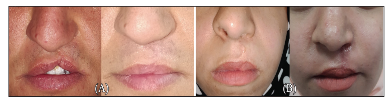
Figure (1) Pre and six months postoperative healing in (A) group I and (B) group II