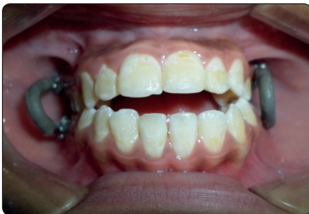
Fig. (1) RMI attached to maxillary and mandibular first molar bands.

The RMI appliance had one elastic spring module on each side that was attached to orthodontic bands on maxillary and mandibular first molars. The terminal ends of the modules were attached with L-shaped ball pin connectors that were engaged into the buccal tubes welded to orthodontic bands (Figure 1). The maxillary tube received a straight endcap, while the mandibular tube got an angulated one. Maxillary and mandibular first molars were stabilized by using transpalatal and lingual holding arches respectively.