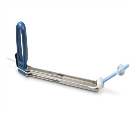
Fig 1: Uterine manipulator during the study.

Laparoscopy was performed under general anesthesia using a 10-mm scope (Karl Storz, Tuttlingen, Germany) and two ancillary 5 mm trocars in the lower abdomen. The cervix was dilated to Hegar 8 and a uterine manipulator (Cooper Surgical Rumi) was placed (Fig. 5). The uterine manipulator was connected to a syringe containing 20 ml of saline with a blue methylene dye. The uterus, tubes, ovaries and neighbouring organs were thoroughly inspected and the presence of any abnormality such as endometriosis, fibroids or adhesions was noted. The assistant injected the methylene blue dye and the spill of the dye through the fallopian tubes was observed. Suction and irrigation cannula was inserted in the supra pubic port for suction of the methylene blue dye out of the peritoneal cavity. Gas was then evacuated from the peritoneal cavity and the sites of the ports were sutured and the uterine cannula was removed.