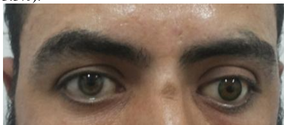
Figure 2: Final post operative cosmetic appearance (Left eye).

(66.6%) and poor with mean of 15% in 6 patients (33.3%).