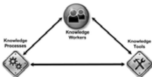
Figure 1. Elements of knowledge management

wide range of factors affecting the creation, sharing, transfer, and acquisition of knowledge. These factors center around three basic knowledge entities - knowledge workers, knowledge processes, and knowledge tools. The breadth of literature examines how these entities interrelate and are affected by variations in the operational environment. Existing research in knowledge tools focuses on specific attributes - technology, usability, or administration (Varghese, 2014).