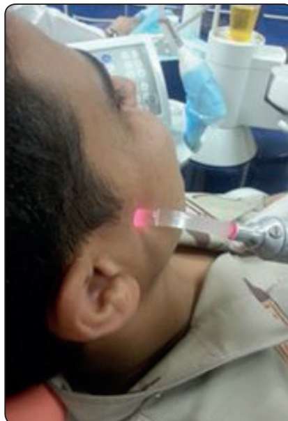
Fig. (II) Showing Application of probe of Diode Laser at three point application at auricular area (anterior, superior and posterior).