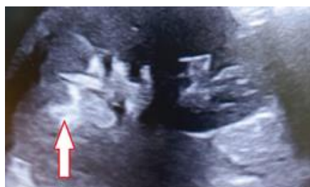
Figure [2]: Intraoperative ultrasound shows the residual stone in the upper calyx of the right kidney for the same above patient in figure No 1

Statistical analysis of data: All statistical calculations were performed by statistical package for social science, version 16 (SPSS Inc., USA). Frequency and percentages were calculated for qualitative data, while mean and standard deviations were calculated for quantitative data. Appropriate tests used to perform the comparison between groups: Chi-square or Fisher exact for qualitative and independent samples “t” test for numerical, normally distributed variables. For calculation of sensitivity and specificity, a 2 x 2 table was performed, and equations were used for calculation as presented in tables. P-value < 0.05 was considered as the cutoff for significance.