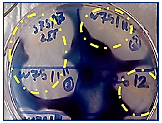
Figure (4): ά-amylase activity of different actinobacterial isolates. The activity was recorded at 55°C and represented by hallo zone around the screened colonies

In this study, actinobacterial and bacterial isolates were identified as powerful degrader of lipid and showed clear zones on tributyrin agar plate at 55°C (Figure 5). The clearance halo around the colonies was generated by tributyrin hydrolysis by isolate-based extracellular lipase production. This result is in confirmation with the data recorded by Lokre and Kadam (2014).