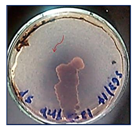
Figure (5): Lipase enzyme activity showing positive strain lipase-producers Activity represented by hallo zone around the colonies of screened isolates (arrow)

Despite the utility of enzymes which have thermostability in molecular biological techniques, it is not also surprising that these have also been proposed as powerful tools for industrial and commercial catalysis (Vieille and Zeikus, 2001). Cellulases are important in the fruit, beverage, fiber, paper and pulp industries, along with agriculture and other research purposes (Cavaco-Paulo, 1996; Islam and Roy, 2018). For many industries, amylase and lipase are useful, such as detergent, milk, clothing, pharmacy, and many dairy products (Patnala et al. , 2016; Hussain et al. , 2013).