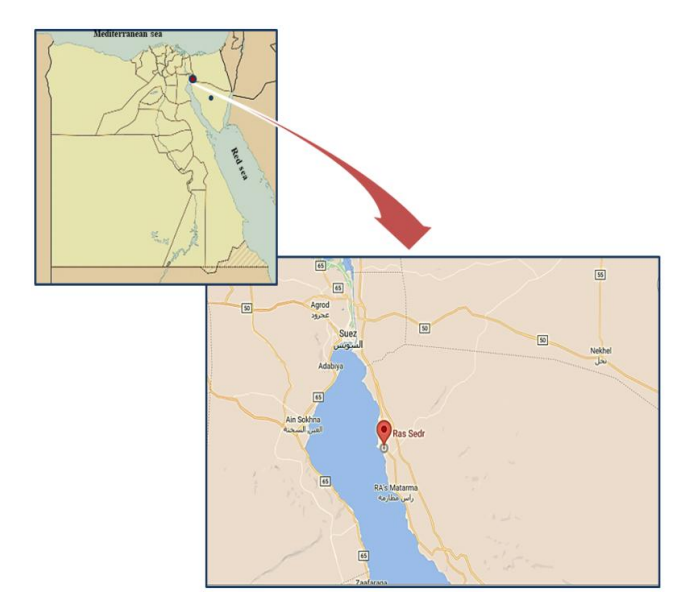
Map (1): Location of the sampling site