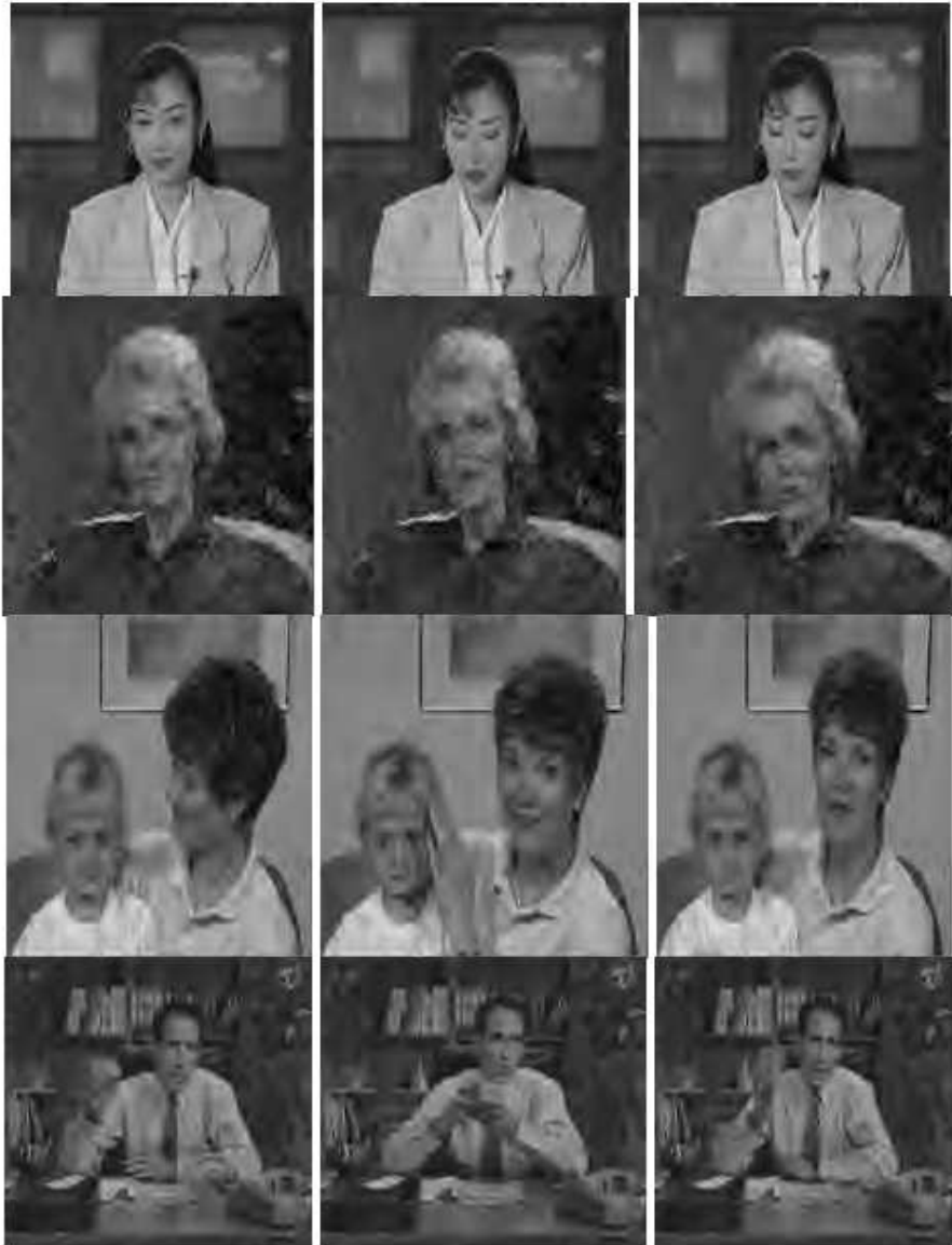
Figure 4. the reconstructed 1st, 40th and 60th frames of Akiyo, Mthr_dotr, and Grandma video sequence using the 3-D SPIHT.