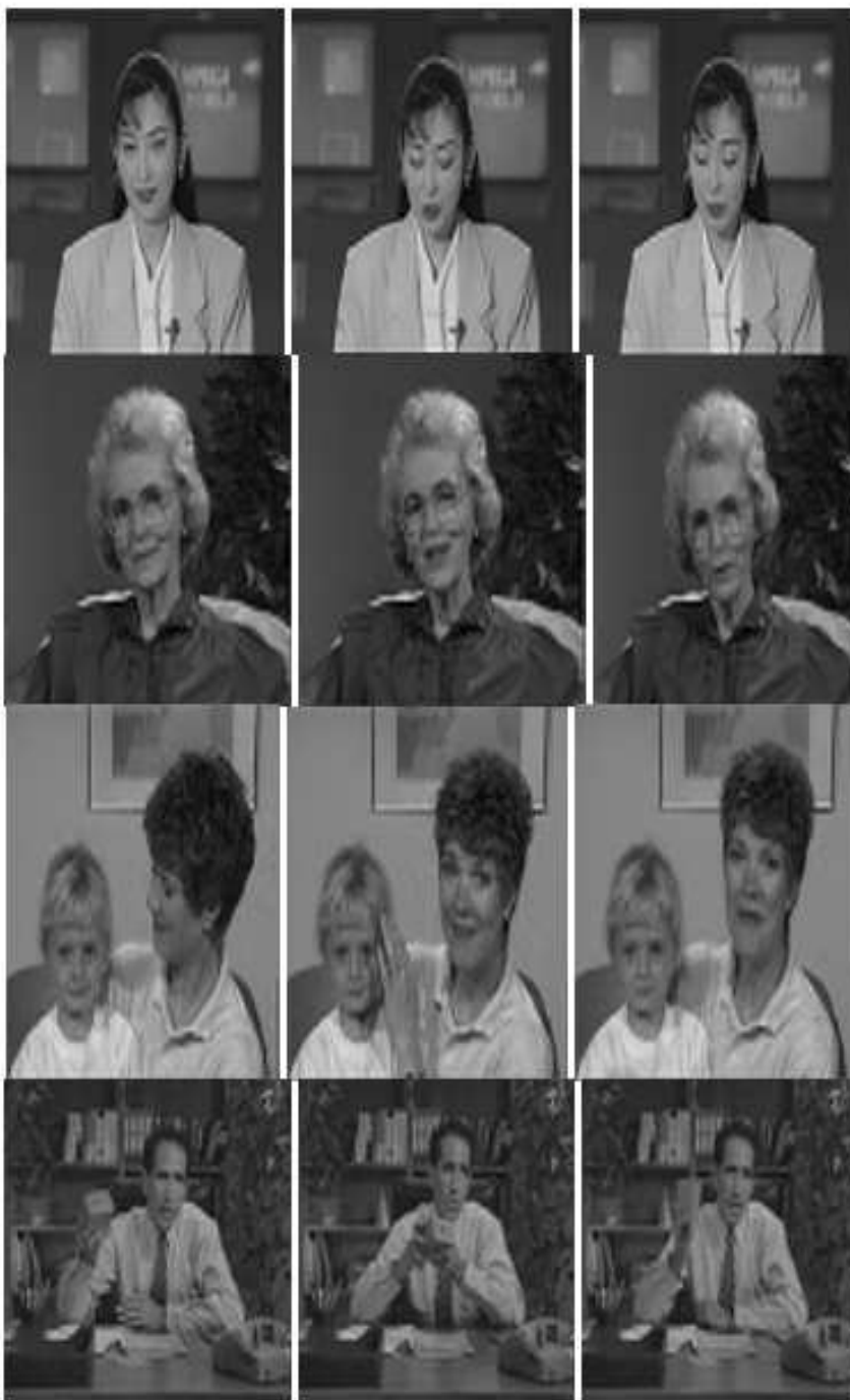
Figure 3. the reconstructed 1st, 40th and 60th frames of Akiyo, Mthr_dotr, and Grandma video sequence using the proposed algorithm.