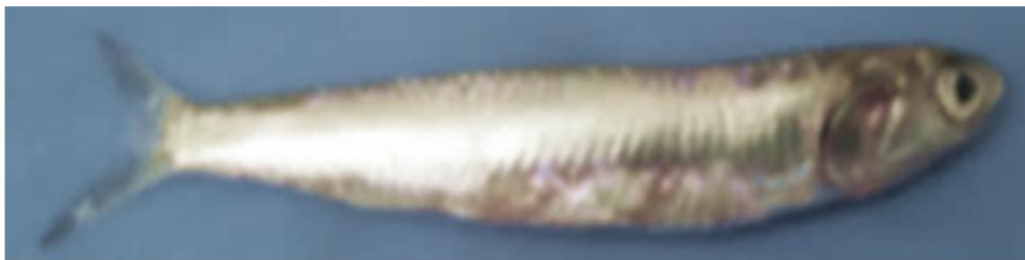
Fig. (1). Raw Sand smelt ( Atherina boyeri ).

Fresh Sand smelt ( Atherina boyeri ) samples (Fig.1) were purchased from daily catch at El-Anfoshy Landing, Alexandria during November, 2019. Then, they were directly transported using ice box to the Fish Processing and Technology Lab., National Institute of Oceanography and fisheries (NIOF), Alex. Branch, Egypt. The average length and weight of samples were 6.75 \pm 0.60 cm and 2.06 \pm 0.49 g, respectively.