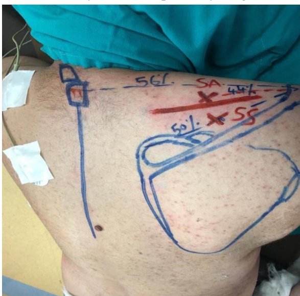
Figure (1): Incision it is placed one centimeter above the spine of the scapula and covering at least two points located 7cm and 11cm from the ACJ with approximately 12 to 15 cm long.

General anesthesia was given to the patient without muscle relaxant. Positioning of the patient in prone or lateral position with head of the operating table raised by 40°. Anatomical landmarks (which should be identified by palpation): the acromioclavicular joint (ACJ), the spine of the scapula, the upper and inner angle of the scapula, the inner border of the scapula, XI and SSN, which are located 11cm and 7 cm medially to ACJ respectively . Figure (1)