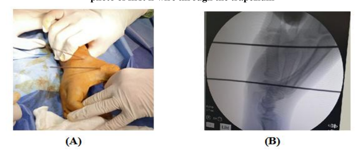
Figure (3): (A) Another k-wire was inserted through the first metacarpal Proximal to the metacarpo phalangeal joint (traction pin), (B) C-arm photo showing another k-wire inserted in the first Metacarpal bone proximal to metacarpo phalangeal joint