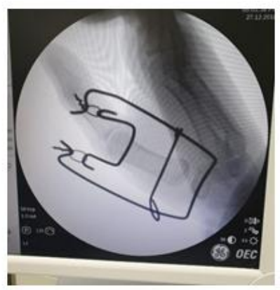
Figure (9): Intra operative C-arm photo shows the frame and the reduction Complete union of the fracture of the base of first metacarpal bone ( Fig. 10 ).