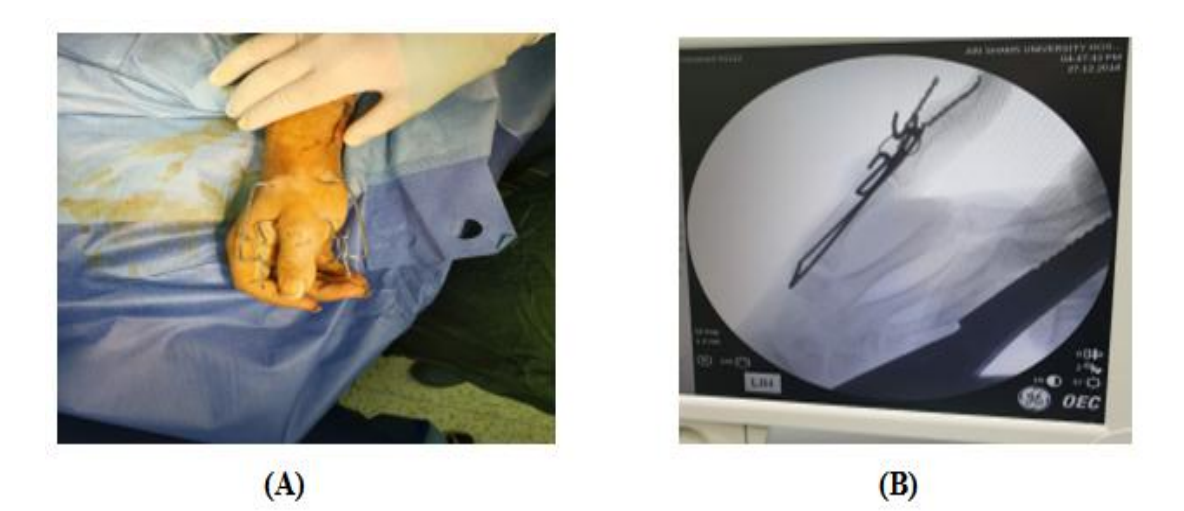
Figure (4): (A) The ends were reshaped into small circles just away from the Skin, (B) C-arm photo showing the reshaped ends of wires