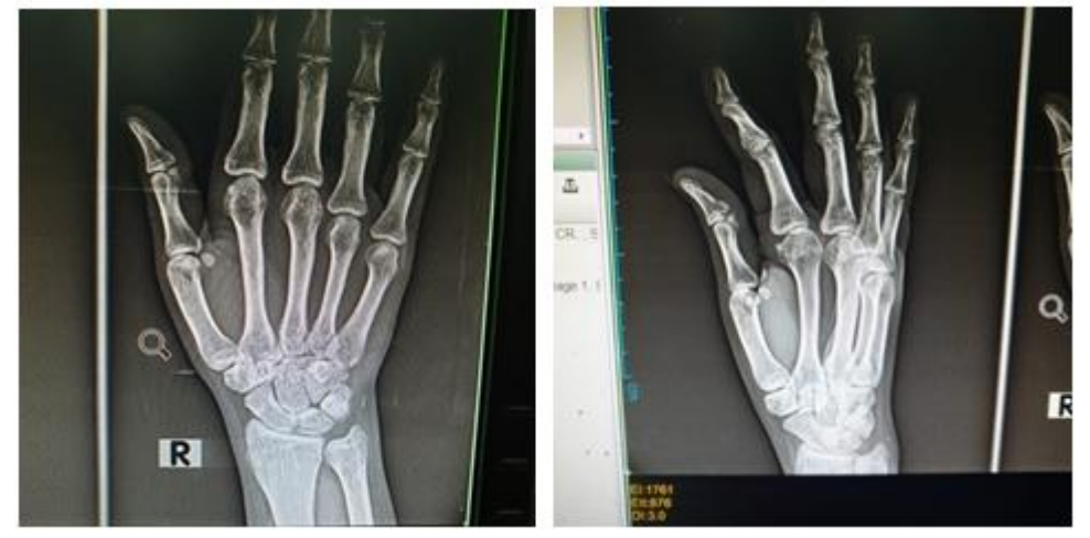
Figure (10): Union three months after operation of the previous case

Figure (9): Intra operative C-arm photo shows the frame and the reduction Complete union of the fracture of the base of first metacarpal bone ( Fig. 10 ).