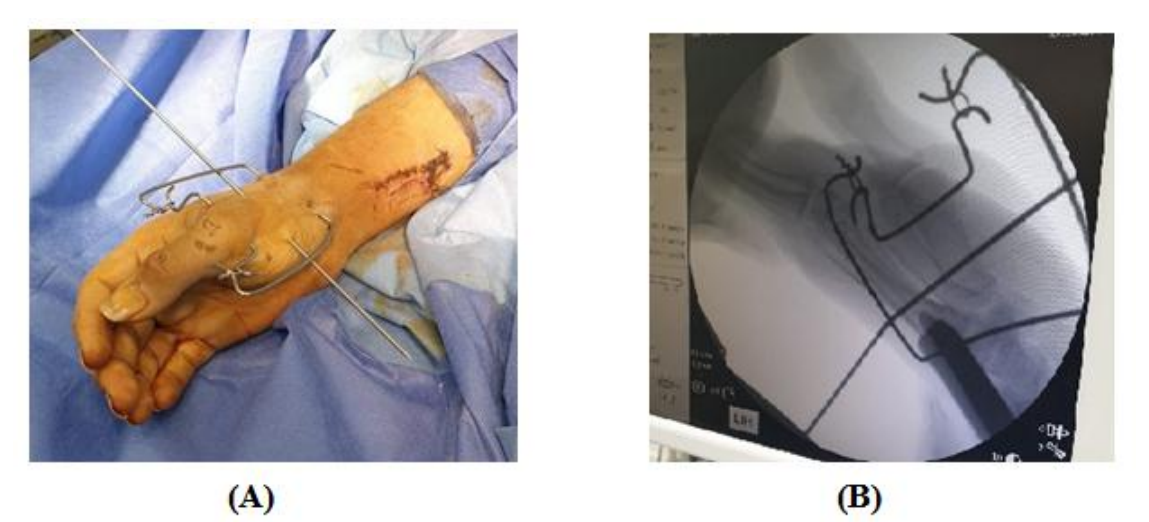
Figure (5): (A) A k-wire was inserted in the first metacarpal just above the fracture site parallel to the previous 2 wires. The wire was bent 90 degrees distally on both sides (reduction pin), (B) C-arm photo