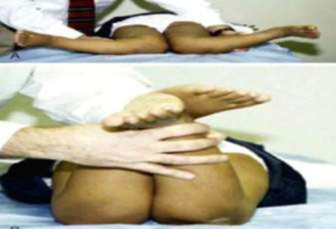
Figure (3): (A) Anteversion measured by medial rotation of hip and (B) lateral rotation of hip (Wells, 2004).

Femoral ante-version is described as the angular difference between the axis of the femoral neck and trans-condylar axis of the femur or simply torsion of the femur. Measurement of ante-version by physical examination is done with the child in the prone position, measuring internal and external rotation of the hip, and making sure there is no rotation of the pelvis. The degree of internal rotation is measured as the angle subtended by the tibia to the vertical line (See figure 3).