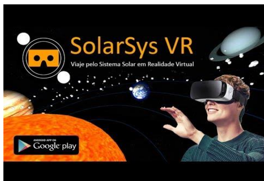
Figure (3) Solar Sys VR - Apps on Google Play

The researcher to develop the motivation of the kindergarten pupil developed some scientific concepts through the use of augmented reality by presenting a set of scientific concepts, which included (the solar system - colors) with Virtual reality technology through some smart phone applications on (Google Play) (Solar Sys VR - Apps on Google Play) , and the researcher designed a card to evaluate the student's performance in terms of range The student's understanding of the scientific concept from two axes (the solar system - colors).