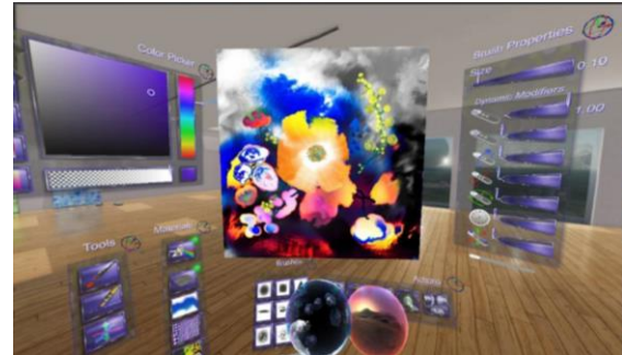
Figure (4) Cyber Paint - Apps on Google Play

The sample included (20) pupils from (2) kindergartens during the year (2019-2020), and they applied the research through (10) sessions at a rate of (2) per week , the researcher presented the concept to the student and explained it in a simple way.