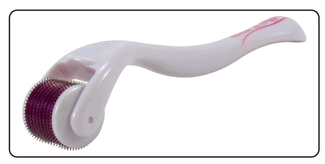
Fig. (1): Handheld derma roller device which had been used for flap preconditioning (DRS, Skin Care Titanium Dermaroller 540 Micro, Allfond Co. Limited, Guangzhou, China).

Data were analyzed using mean, median, standard deviation, minimum and maximum in quantitative data and using frequency (count) and relative frequency (percentage) for categorical data.