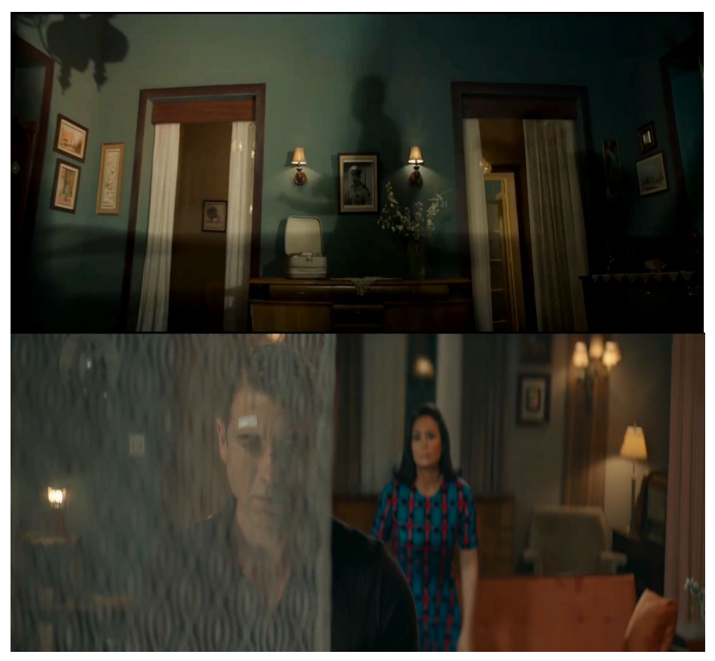
Figures No. (4,5) Interior Scenes of the Protagonist's Home

The state of the returning traumatized leader was aesthetically presented with colors, lights, shadows and dimension in frames. Note the image caring wife trying to break her husband's wall to get him out of his state and giving him hope, the defeated leader that cannot notice any existence but of the shadows of the soldiers and their images haunting him. The consistency of colors in these frames and their difference from what was previously presented and what is to come next, transfer the audience with characters from phase to phase to believe that this defeat is temporary.