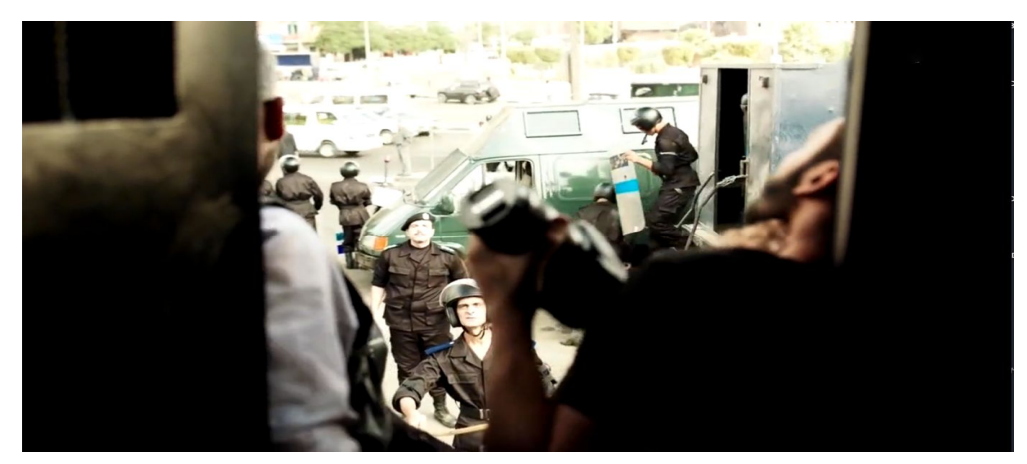
Figure No. (23) An Image of the Police Detaining Protesters

The whole movie is set in the back of a police car where one by one is filled with captures from different parties because of their evolvement in the streets at such a critical time.