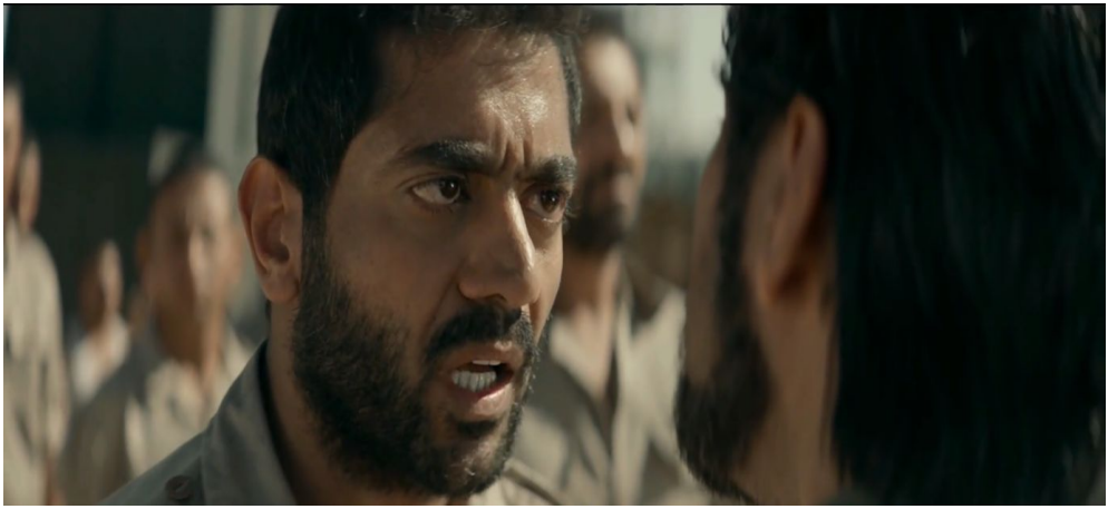
Figures No. (9,10)