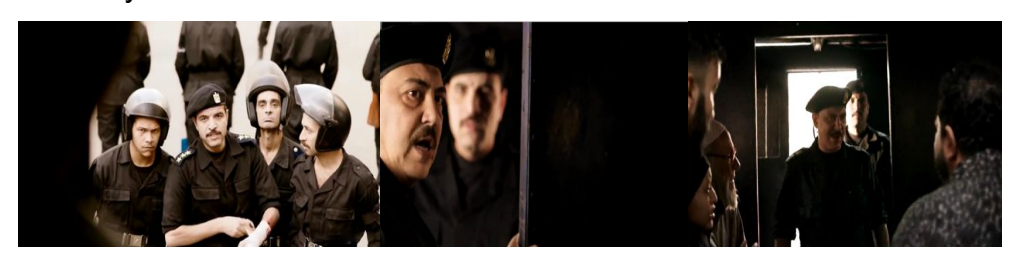
Figure No. (25)

With protests rising, forces continue to capture whoever gets in their way regardless of their age, gender or political stands. Till the car is filled with a representative of almost each Egyptian category at that time. The movie leans more to the independent cinema style. It is not a commercial high-end production movie. The camera language is a reflection of the chaotic, unstable environment of the protests we can notice the use of the handheld camera movements that shakes with the unstable movement and crowds, conveying the sense of realism in the story.