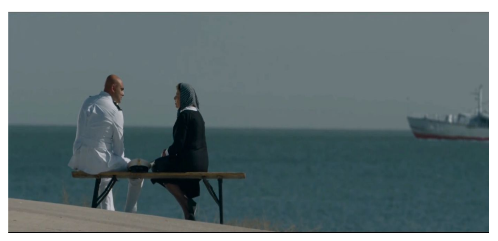
Figure No. (6) An Image Depicting the Sympathy of an Officer towards the Mother of an Egyptian Captive

The movie stresses on the image that at time of war Egyptian people and all Egyptian forces become one and stand hand in hand with all conflicts aside in the face of the enemy. This is portrayed in what the movie succeeds in showing. The main focus is not just the representation of the Egyptian army as a leading character but rather through the depiction of all army forces, commando's forces, navy forces and air forces. In the frame one sees the leader of Navy Forces in a visit of his aunt wondering about the leader's cousin who was captured as a prisoner during the battle. This signifies the warm emotions of the aunt and sheds light on the leader's role to comfort her.