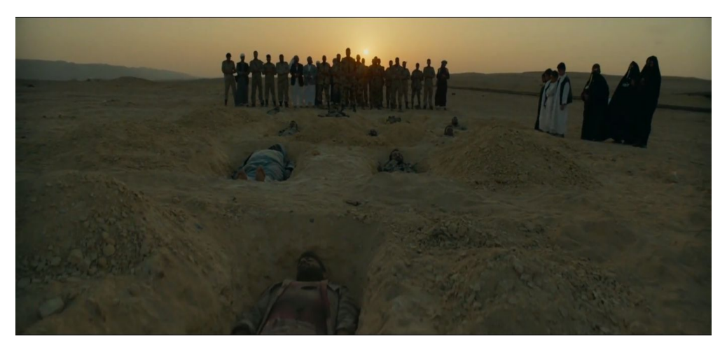
Figure No. (22) An Image Depicting the Army Honoring the Fallen and Burying Them

He is alone in a medium shot with high angle emphasizing the weakness and fear of the commander that once thought he was undefeatable.