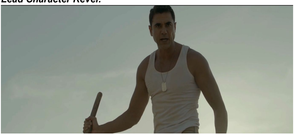
Figure No. (2)