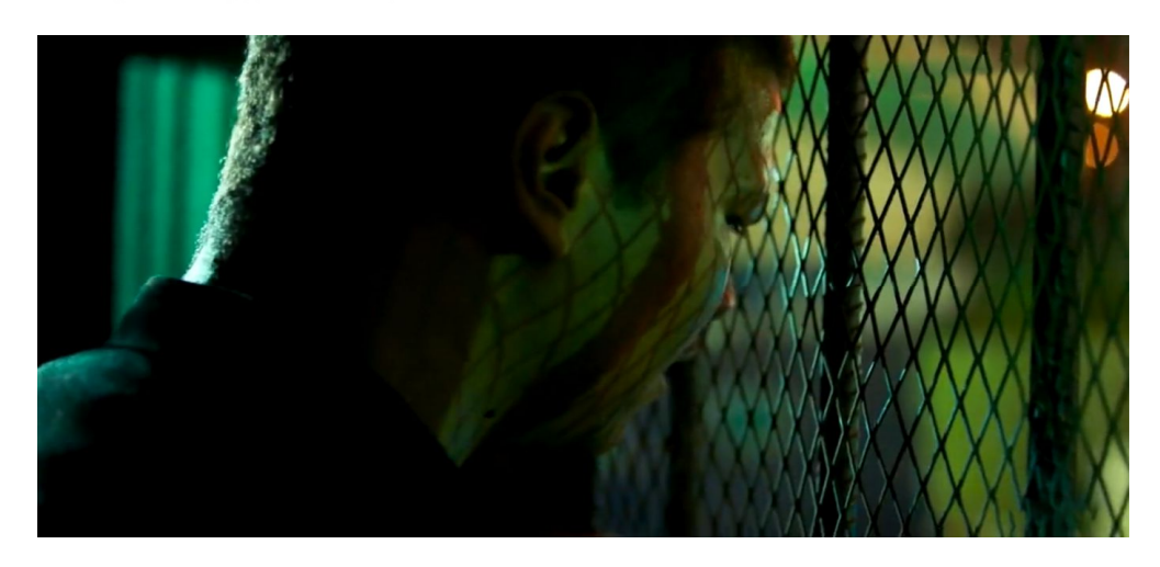
Figure No. (27) An image depicting the detention of a security personnel who was sympathetic towards the detainees

The police officer is getting held inside the car for his actions. With a medium close up shot and a use of light and shadow in this frame working all together to reveal the emotions of this officer being locked up by police force for his call for justice.