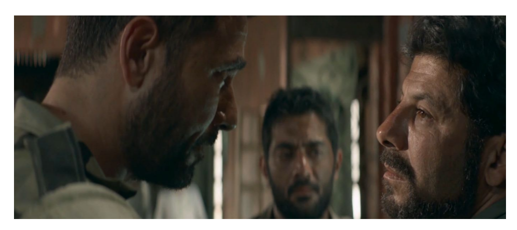
Figure No. (20) picture showing the strength of the Egyptian officer versus the Israeli officer

After successfully achieving their mission, in a wide celebratory frame, they preserve fires and damages as fireworks behind the victorious army as they head back after destroying the enemy camp in the Egyptian lands.