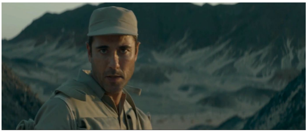
Figures No. (14,15) Images showing views of defiance and confrontation between the Egyptian officer and the Israeli officer