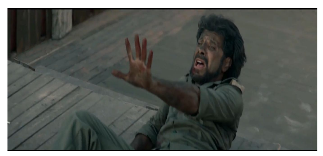
Figure No. (21) An Image Portraying the Weakness of the Israeli Officer

He is alone in a medium shot with high angle emphasizing the weakness and fear of the commander that once thought he was undefeatable.