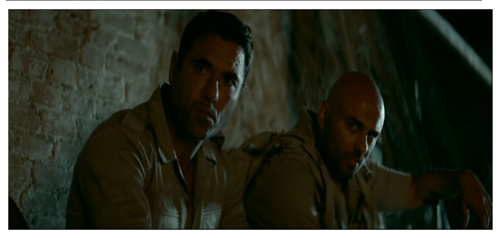
Figures No. (11,12,13)