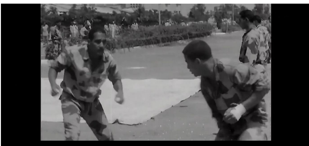
Figures No. (7,8) Images of Intensive Training Exercises in Preparation for War

After all forces came together and got the orders for an almost suicidal mission behind the enemy lines, we have the image of the army being trained in a black and white parallel, edited with real footage of the real Egyptian army at that time. The use of these archived footage adds to the story the element of realism of the incidents and made viewers come back to the fact that this is not just a movie; this is true Egyptian history.