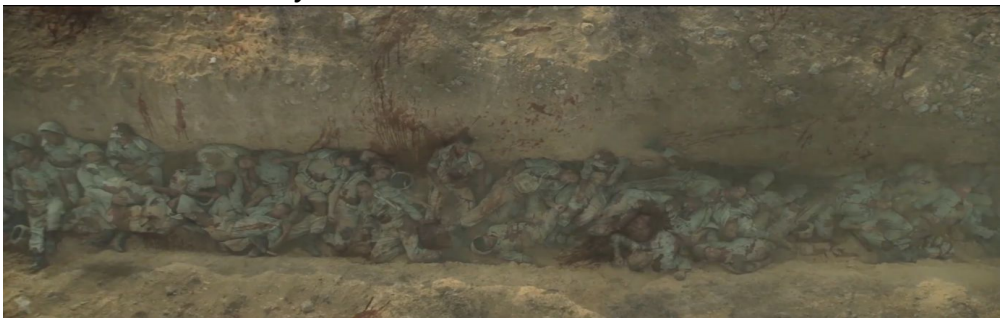
Figure No. (1) A Cinematic Scene of Egyptian Fallen Heroes during the War of Attrition