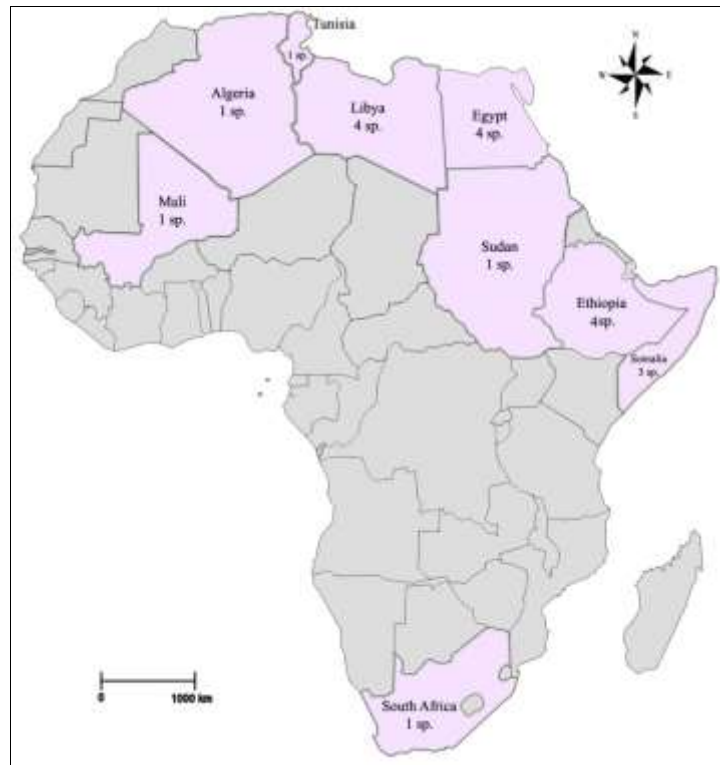
Fig. 2. Map showing the geographic distribution of Terminalioxylon and the number of species in African countries. sp. = species.

As shown in Table (2), four Terminalioxylon species are reported from Egypt, namely T. edwardsii , T. geinitzii , T. intermedium and T. primigenium . Table (1) shows that T. primigenium is the most widespread species of this genus in Egypt (12 sites), followed by T. intermedium (six sites) then T. geinitzii (two sites). The present work and Table (2) show that T. edwardsii occurs also in two sites, from the Oligocene of the CPF (present work) and from the Oligocene/Miocene of Giza Pyramids (Kräusel, 1939). Tables (1) and (2) show also that T. primigenium occurs in all the sites in which the other three species of the genus exist and that the CPF at Qattamiya is, hitherto, the only site in which the four species are known to exist together. Table (3) includes a comparison between T. edwardsii reported from the Giza Pyramids and the present specimen, where it is clearly evident that both specimens are anatomically similar, although slight differences in the quantitative features are noticed.