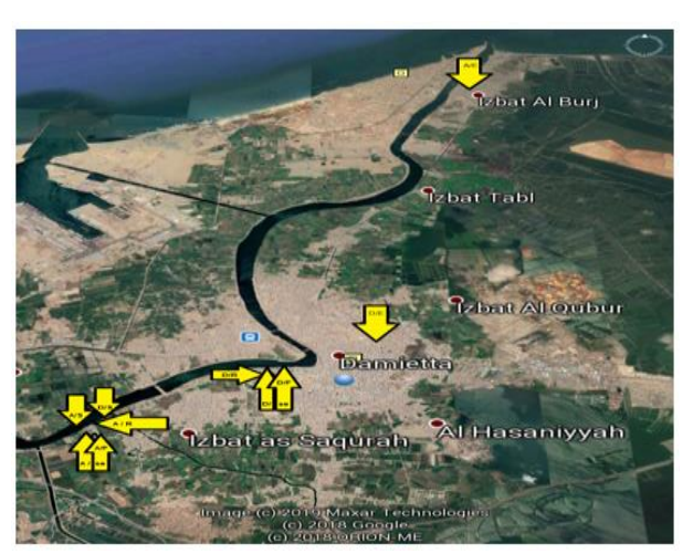
Photo .1. Sites of collected water samples in Damietta City during winter 2018

All examined sites used for samples collection are shown on map of Damietta city (photo 1). Samples were collected in 100 ml sterile glass bottles of 20 cm below the water surface to avoid floating materials, preserved in ice-box for physico-chemical examinations that were carried out in Chemical laboratory of Drinking Water and Sanitation Company in Damietta, Al-Moalmien Square; Musharrafa Street, Damietta, Egypt. microbiological examinations were carried out within 6 hours after collection in the microbiological laboratory of Microbiology Department, Faculty of Agriculture, Damietta University, Damietta, Egypt. Three replicates of one ml of each sample were used for microbiological examinations.