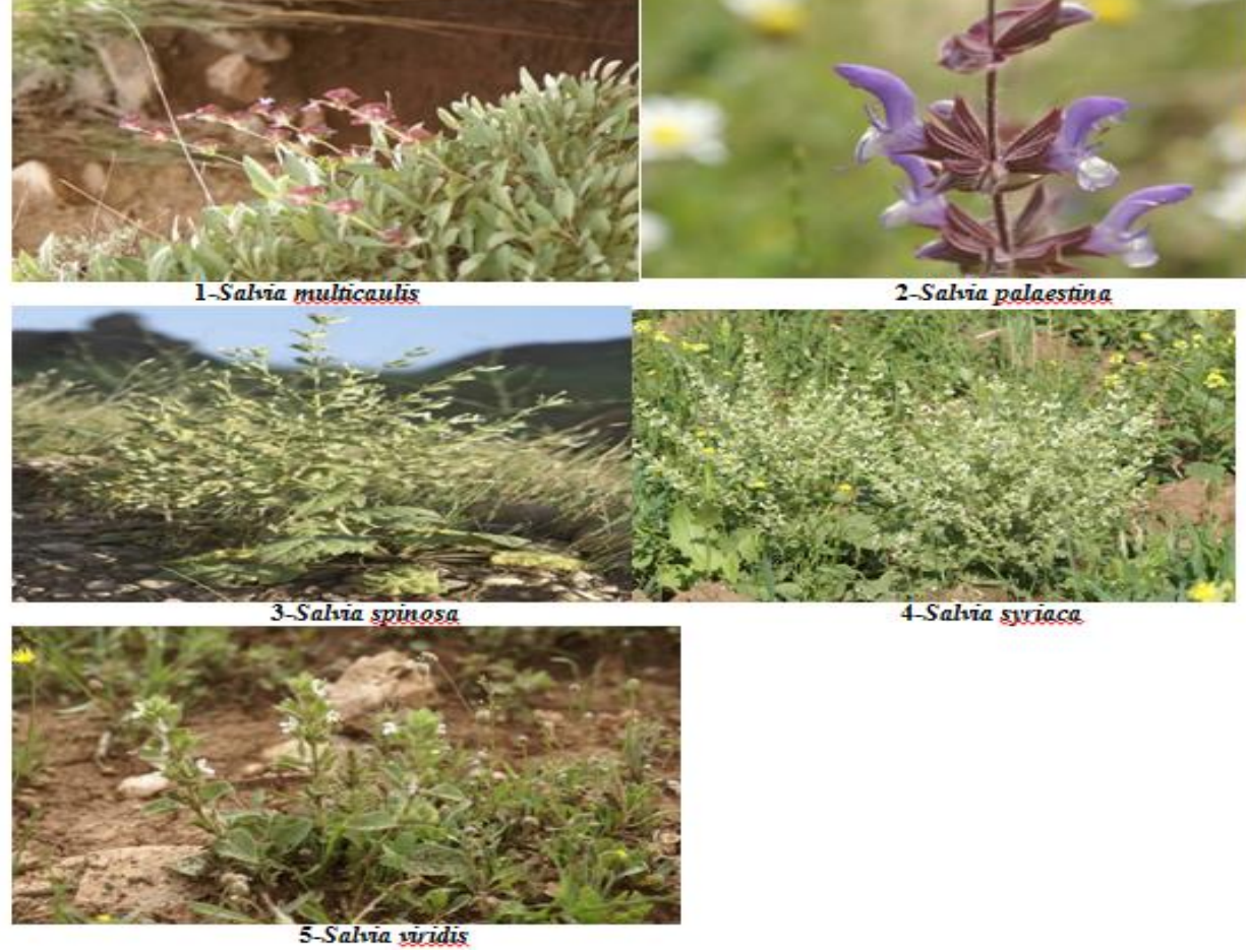
Fig. 1. Variation in the shape of the genus Salvia taxa.

The current study was based on the fresh plant specimens of five species Salvia ( S. viridis, S. spinosa, S. syriaca, S. multicaulis, and S. palaestina ) was selected for this study, this species under Lamiaceae family, collected in different parts of Iraqi Kurdistan Districts from their natural habitats and directly from the field for the period from March to September 2019. The samples were collected at the flowering stage and were compressed, dried and stored for diagnosis. For each of the taxa studied, habit and flora photos are shown in fig. (1).