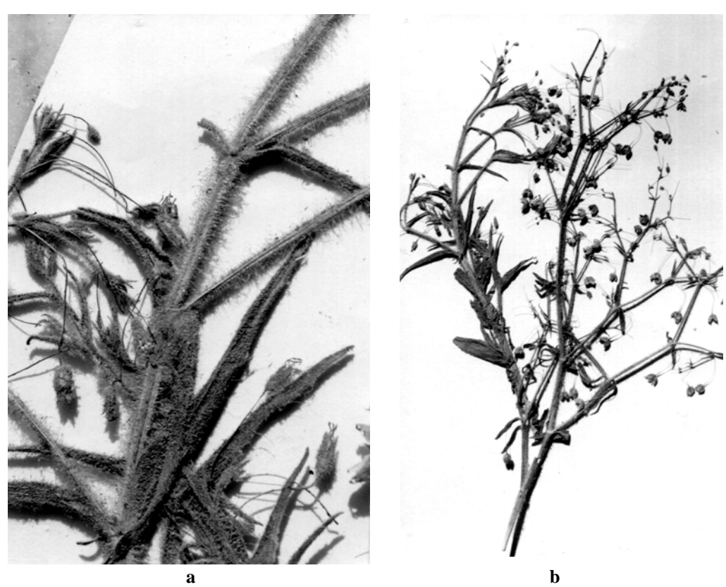
Fig. 2 : Gypsophila pilosa , a. part of stem with pilose hairs; b. flowering and fruiting plants; c. mature seed as seen by SEM. Eastnorth of Assiut town, reclaimed farmland; Aprile, 2000, El-Naggar, s.n.