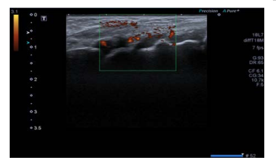
Fig. 2: Ultrasonographic longitudinal scan of the Rt. 2nd MCP showing grade II synovial thickening (Lt. photo) and of wrist joint showing grade 3 synovial thickening and grade 2doppler signal (Rt. photo).