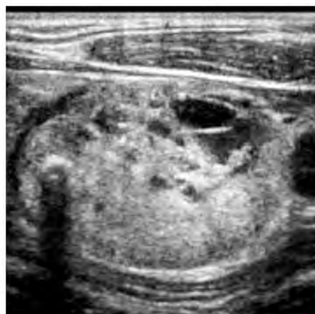
Fig. (5): A nodule at the left lobe with characteristic smooth border, hyperechoic, wider than taller and presence of macrocalification.