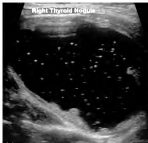
Fig. (4): A smooth anechoic nodule at right thyroid lobe.

taller and presence of macrocalification (TI-RADS level: TR 4) (FNAC: LEFT: Colloid nodule with hyperplastic changes. RIGHT: Colloid nodule with cystic change).