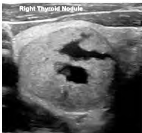
Fig. (3): A smooth hypoechoic nodule, mixed cystic and solid, wider than taller at right lobe.

Fig. (3) show a 27 years old female with a smooth hypoechoic nodule, mixed cystic and solid, wider than taller (TI-RADS: 3), (FNAC: Follicular probably colloid nodules with adenomatous hyperplastic changes).