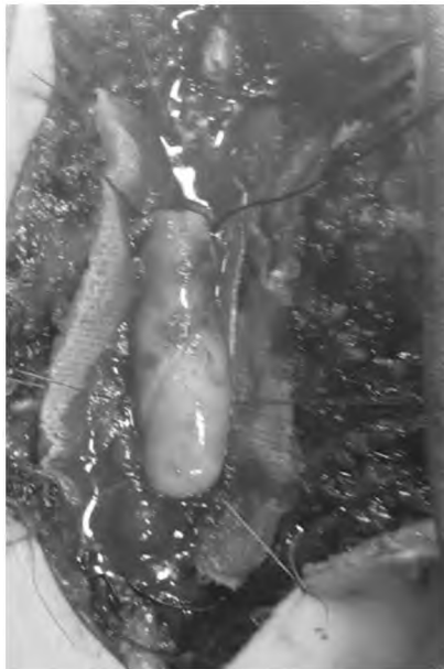
Fig. (3): Illustrates an intra-operative image of a lumbar neurofibroma operated via posterior midline approach and laminectomy.