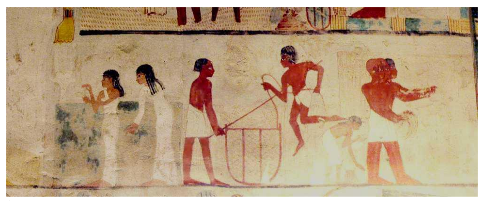
(Fig. 5) The women wear dresses, one of which wears the common strapped dress, whilst the other wears a long sleeve dress similar to Nakht's wife, however it is not translucent. 29

By the eighteenth dynasty new dress styles became popular, the most prominent style being the long, flowing, pleated linen dress.30 Later by the nineteenth dynasty, queen Nefertari wife of Ramses II is represented in her tomb (QV 66) at the Valley of the queens, she wears a white linen dress that is not at all form-fitting like, and her waist is emphasized by a long, red sash. The sleeves of Nefertari's dress are loose and flow outwards, joining in a triangular shape at the ends, near her elbows. There are notable pleats on the body and sleeves of the dress caused by the shading applied on the painting.