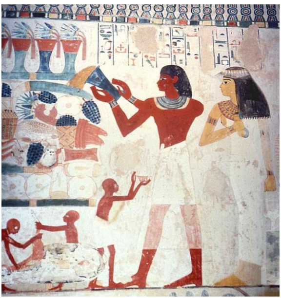
(Fig. 4) Nakht wears a long translucent drape showing his short kilt and the lower part of his legs. Whilst, his wife wears a long, tight, one shoulder dress reaching above her ankles while one arm has a translucent sleeve. 27

The lower register has a representation of two women harvesting flax; a job which was usually done by men. The men working in the fields were represented wearing different kinds of linen kilts. Some wear a knee-high kilt with a straight edge, while the rest of the men are also shown with kilts that have slits at the bottom resulting in a triangular form. While the women are represented wearing a similar dress to that of Nakht's wife except that the sleeve is not transparent (fig. 5). The transparency of clothing was very much popular during the New Kingdom times.28