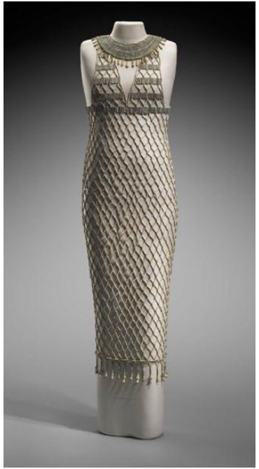
(Fig. 6) A bead net dress. 40

linen dress or worked into a separate net worn over the linen. It was discovered as part of the untouched burial of a female contemporary of King Khufu. The color of the beads has sadly faded, but the beads were originally of blue and blue green colours imitating lapis lazuli and turquoise. At other times, beads or buttons, which were never used to close openings, were sewn to the dress in pattern like formations.39