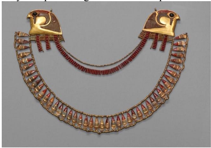
(Fig. 7) A falcon-headed terminals necklace belonging to Tuthmosis III's foreign wife. 42

amuletic and status purposes. An example was the beautiful necklace of one of the three foreign wives of Tuthmosis III. On the back of the falcon-headed terminals is the name of King Tuthmosis inscribed demonstrating that it was a present to his wife. All the latter imagery was not possible to be represented within the use of white linen. Therefore, adornment in the form of jewellery was pivotal for making certain societal statements that were key in representing an individual's place in society. 41