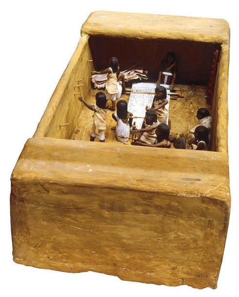
(Fig. 1) Model of a weavers' workshop from the Meketre collection.19