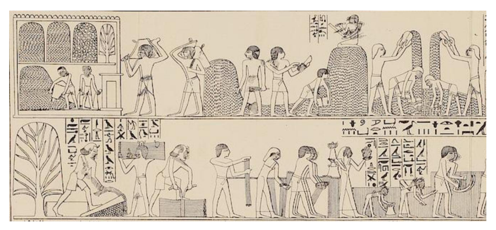
(Plate 1) Agricultural scenes from the 18th Dynasty tomb of Paheri at El Kab.13

After pulling, the flax is then dried, de-seeded, soaked and beaten before being spun into thread.14 No depictions of the spinning process are found until the Middle Kingdom, wherein three different methods are shown.15