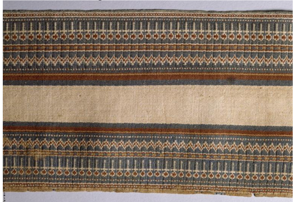
(Fig. 2) Ramses III's girdle.22

royalty and officials while the simpler weaves were used throughout the classes. Beyond weaves, fringe could be added to the border of garments, as found in the tomb of Khaa TT 8, an architect of Amenhotep III.