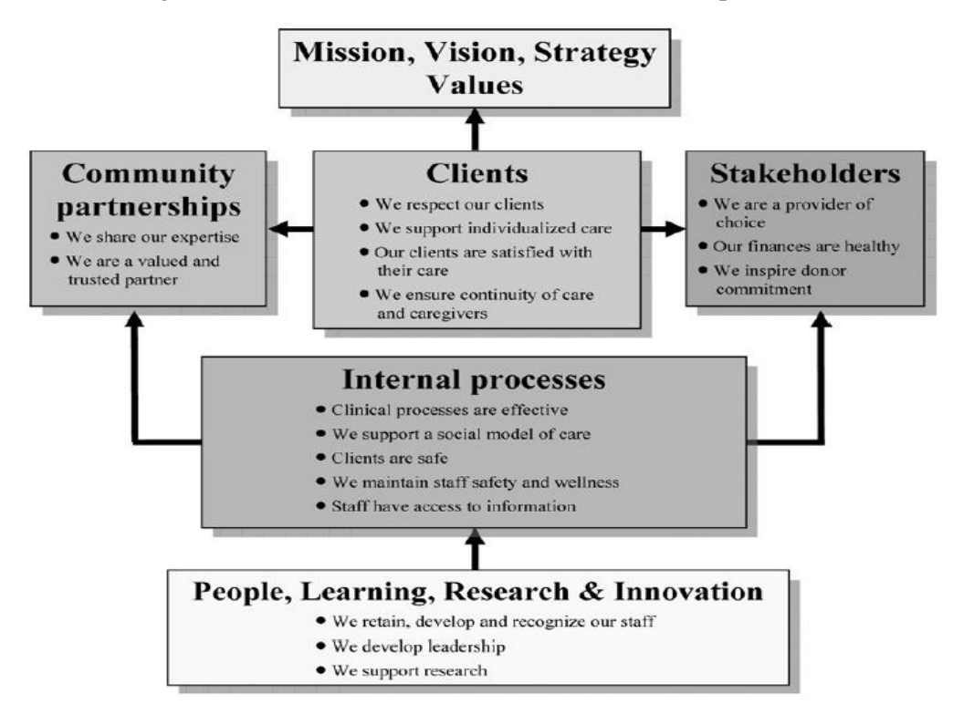
Fig2: The Framework of the Balanced Scorecard Perspectives.