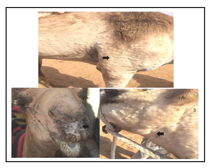
Fig 1: A camel showing numerous cutaneous papules all over the body

Fig 2: Mucopurulant nasal discharge from infected camel