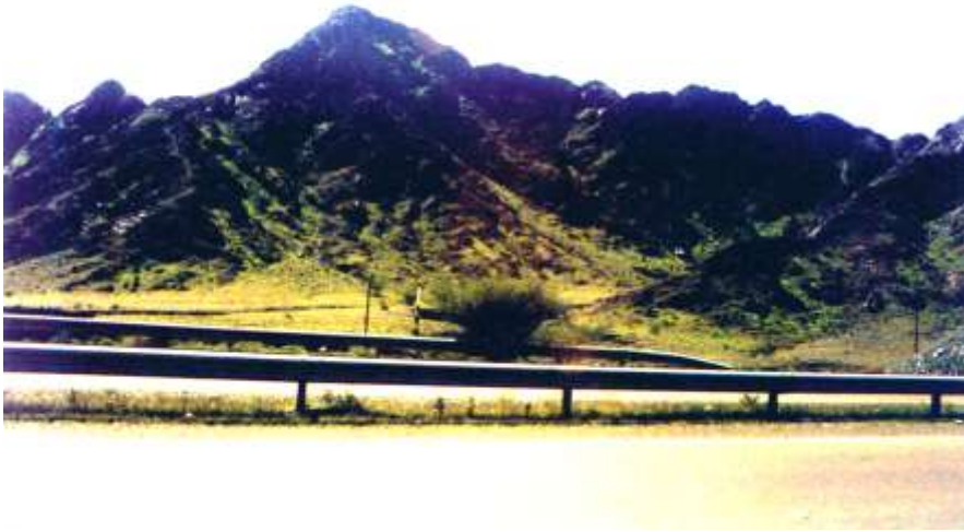
Fig. 3: Vegetation growing in runnels and slopes of one of the mountains located along Fujayrah-Sharja main road, 3.2. 1998