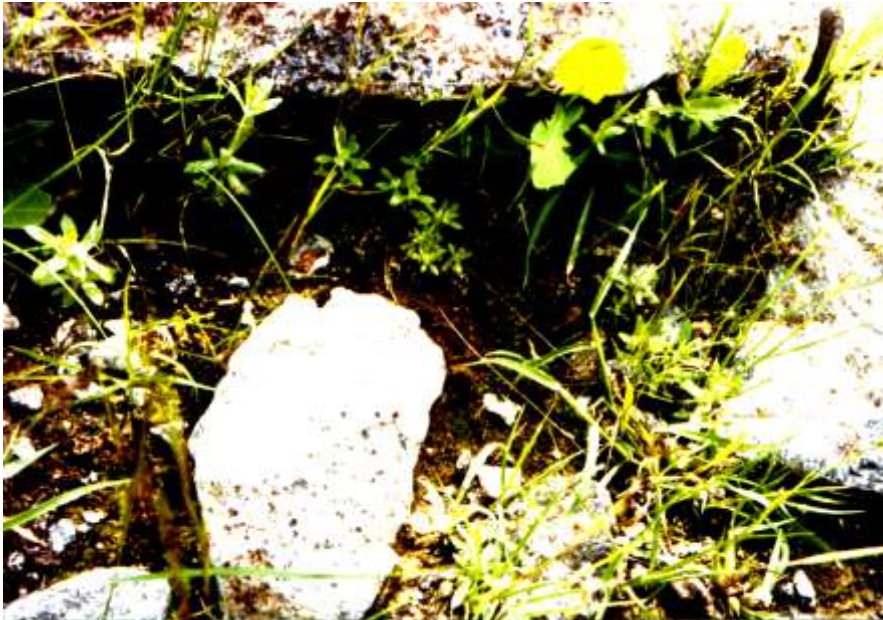
Fig. 3: Entosthodon attenuatus (with green unrip capsules) growing among rocks with herbaceous flowering plants, site 6, 6. 2. 1998.