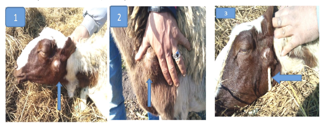
Figure(1): abscess in parotid lymph node, Figure(2): abscess in prescapular lymph node. Figure(3) open abscess creamy pus.