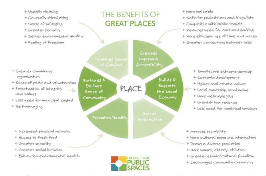
Figure 2. More than just space - quality public spaces hold significant benefits for cities(c) Project for Public Spaces. Source (http://www.pps.org).

Space that is open and accessible to the people is known as a public space. There are so many things included in the public spaces, such as pavements and roadsides, gardens and parks, public squares, and beaches included in public spaces. Some government buildings are also included under the public spaces, such as libraries though limited areas of these places and usage are limited. Some privately owned buildings and other properties, although they are not considered as public spaces, they play a significant role in the visual landscape of the public; outdoor advertising is an example of it. In recent times, the shared space concept has been introduced, and it has advanced to promote pedestrians' public space experience. This space is considered to be used the automobiles and other moving vehicles collectively. The public spaces' infield of philosophy has also become a touchstone and visual arts, geography, cultural-based studies, urban designing, and social studies. The public space is a word which is sometimes misconstrued to mean a different kind of things such as a space to meet up which is among the social space's broader concept. For these type of public spaces commons is one of the earliest examples. No tickets or entry fee for example is taken to gain entry into these spaces. With the presence of public the non-government malls are the examples of private spaces.