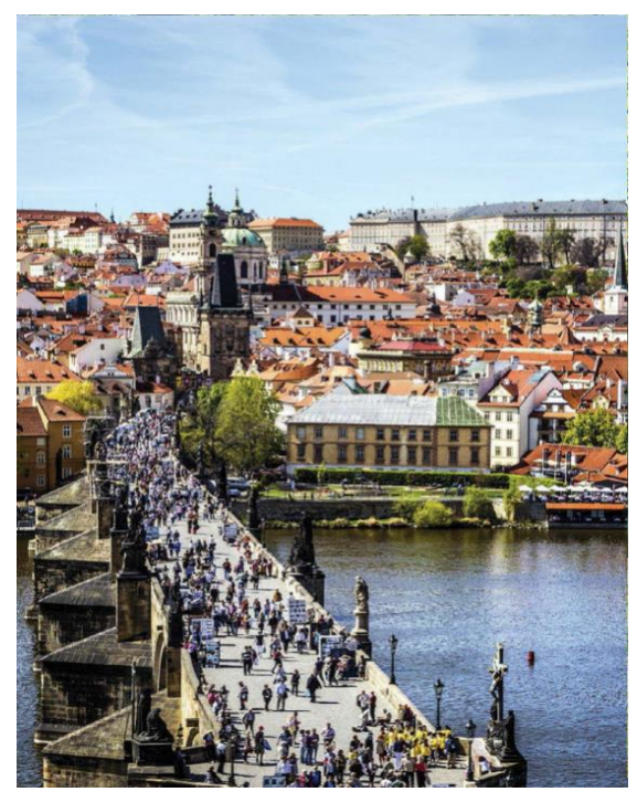
Figure 4 Charles Bridge, Prague, Republic of Czech.