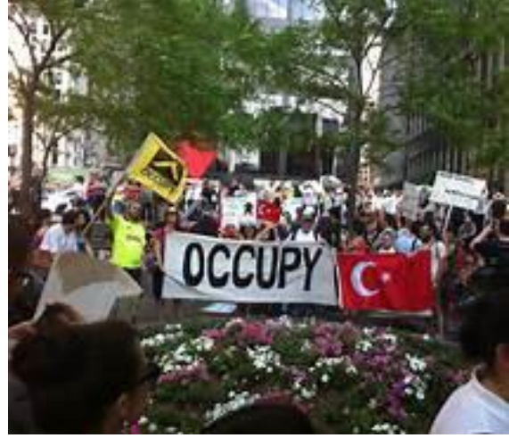
Figure 5. Zuccotti Park.