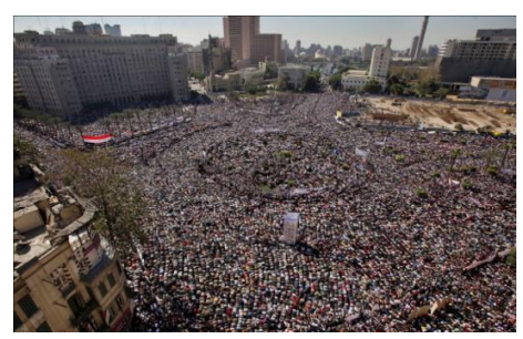
Figure 4, Tahrir square witnessed the January 25th Revolution in 2011.

Millions of Egyptians set out for "food, freedom and social fairness" on January 25th, 2011. Tahir Square, the 18-day sit-in, or ' Midan,. 'began in Egypt in social networking sites in virtual public spaces that played a crucial role in the coordination and mobilization of activist groups. The virtual space became the "last free space" for those activists, expressing their views that everyone had become a sender, recipient, and active partner in decision - making. The January Revolution reinforces the physical relationship between man and Place. Nothing would change without the presence of an urban "real space" as the tool for pressure, despite the power of the social media in this revolution. There is no distinction between the "virtual spaces" from the actual physical spaces. Tahrir Square is essential because it is very close to many government buildings. Therefore, Tahrir's takeover would be a confrontation among protesters and symbols of the state's formal authority. The high visibility where the mass congregation within a circular space would create an image of