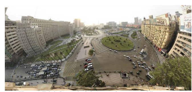
Figure 5. Tahrir Square in Cairo's most important public space. (Attia, S.2011)

intensity and advantages is another essential aspect of this space.