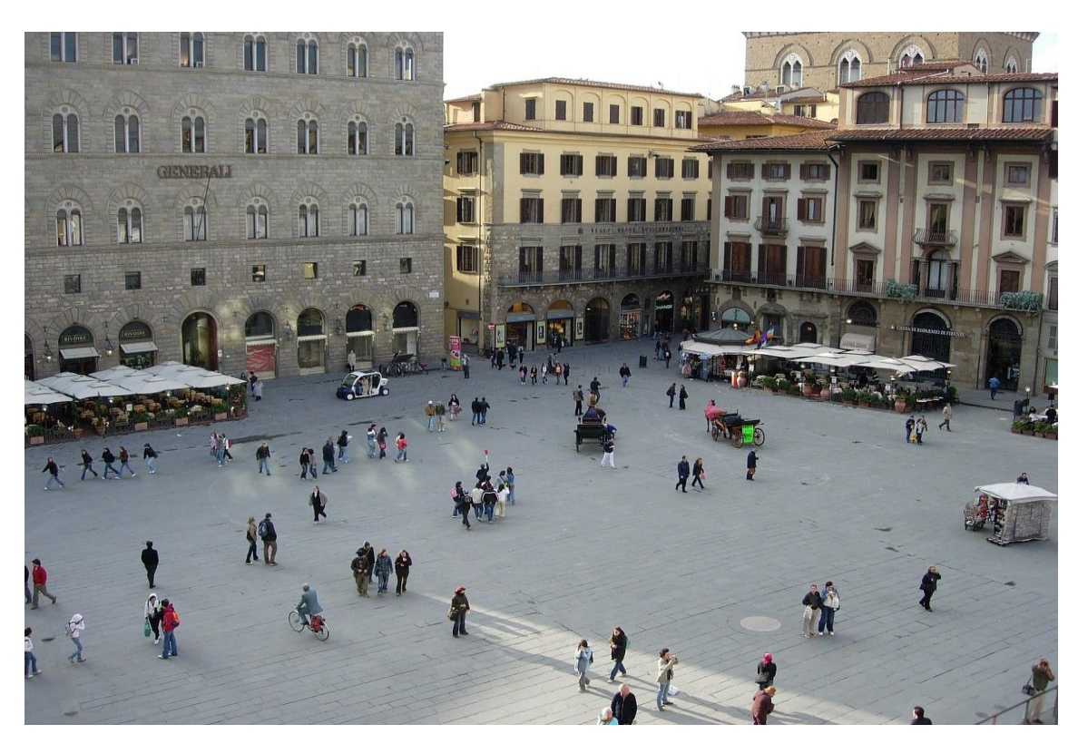
Figure 3.Piazza Della Signoria, Florence, Italy.

concession to room utilization. As portrayed in the Kropf Conceptions of Change in the Built Environment (2001), The word type or typological component expects the structure and capacity of a general idea of a specific spatial element, which is depicted by society. This interchange between people, their thoughts, and their environmental factors show that typologies result from social propensities and social examples. The advancement of spatial typologies, along these lines, includes immediate They adjust to some ecological circumstance and hence look for the distinction to react to regular formative needs. This spatial change model underlines the social component's significance in creating a room, both the spatial structure and its representative importance. The association is liable for making dynamic mutual spaces because the room's structure and capacity straightforwardly rely upon the incorporation of shared spaces in the planning cycle. However, the complexity of the findings in today's urban landscape suggests that the social contradictions in spatial function and meaning are the basis of urban change, hindering progress while growing social and spatial fragmentation. When this relationship is compromised, the relationship between people and space determines a town's identity and image.