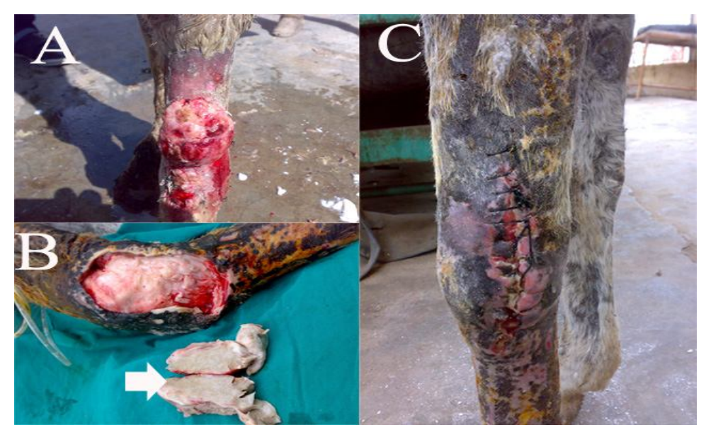
Fig.1: A, An eight-year-old donkey suffering from ulcerative granulomatous lesions. B, Surgical removal of tumor like mass (white arrow). C, Surgical interference of the lesion.