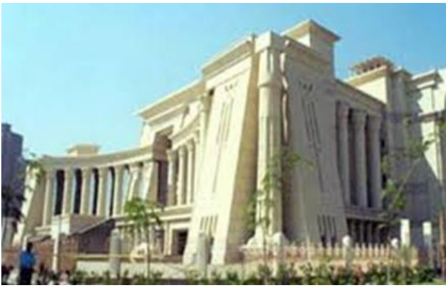
Shape (2) Side view of the supreme constitutional court in Cairo.