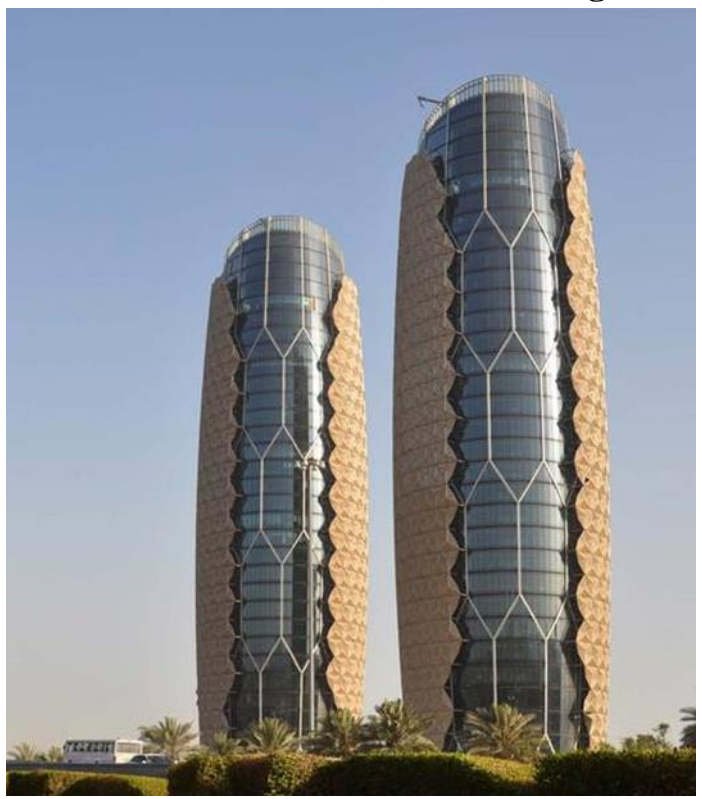
Shape (5) Al Bahr tower in Abu Dhabi