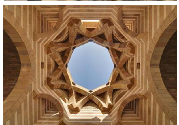
Shape (4) Different images of AUC. (American university) Residence in New Cairo

The new American University building is inspired by Islamic architecture and is considered a kind of preserving the multi-civilizational identity in Egypt. The design was distinguished by the following: