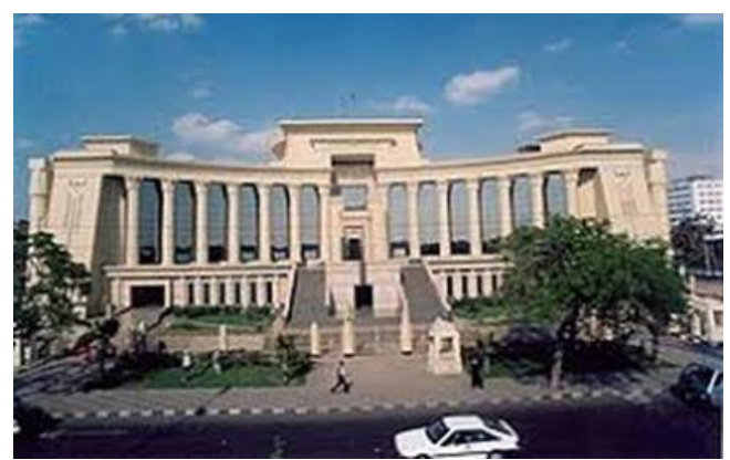
Shape (1) Interface of the supreme constitutional court in Cairo.

- The building of the supreme constitutional court in Cairo, designed by the architect dr./ Ahmed Metto.