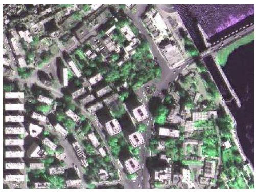
e. Merged image using Brovey technique Fig.1: Visual inspection to evaluate the merging result qualitatively.