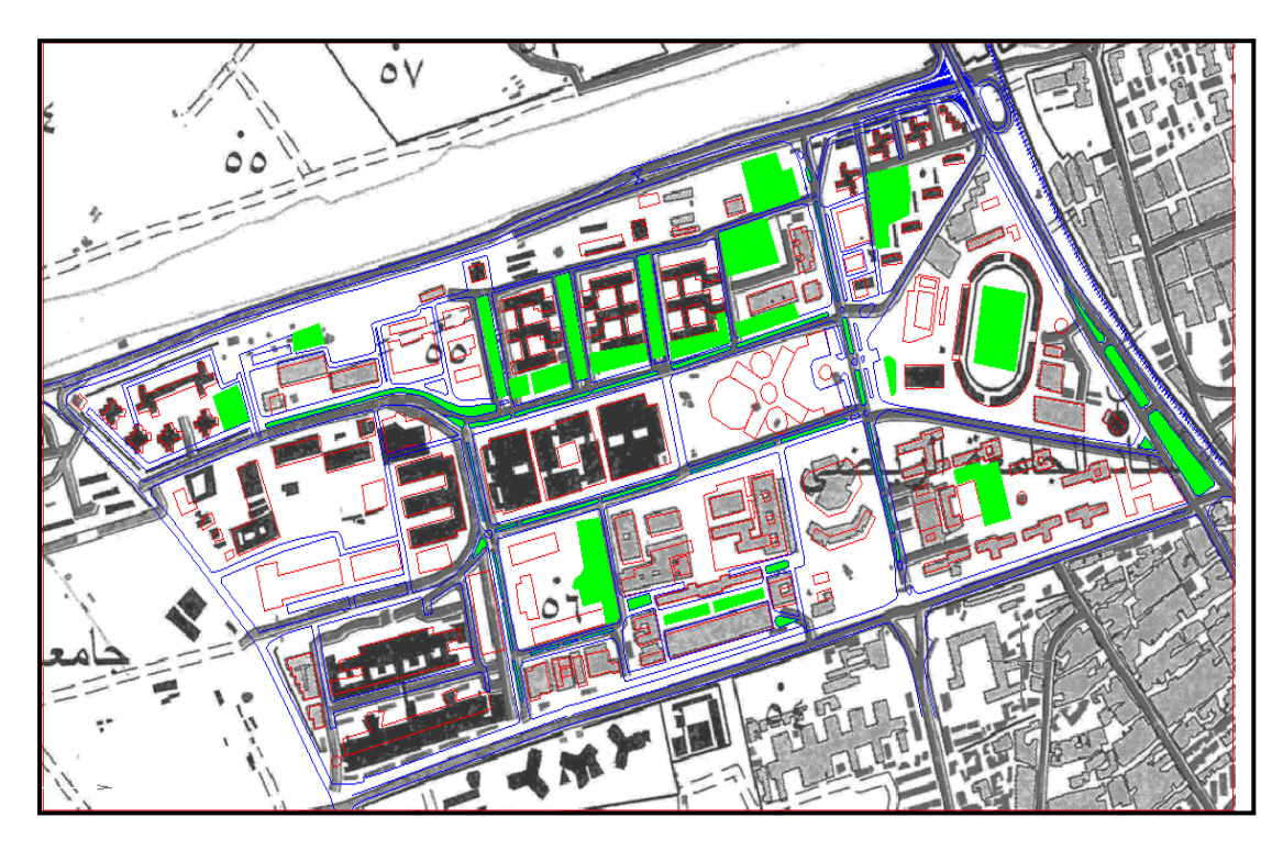
Figure 2.b: The results after overlaying process.