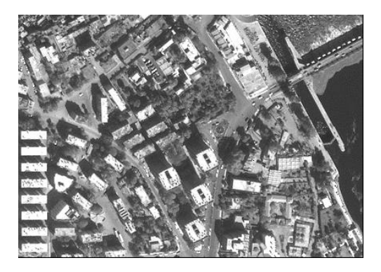
a. Part of the original panchromatic image

Principle Component Analysis and Intensity-Hue-Saturation methods are categorized as statistical method. On the other hand, Brovey method is categorized as an arithmetic combination. The merging process can be evaluated in terms of spatial and spectral quality, respectively. The assessment of spatial quality can be evaluated by comparing the panchromatic image and the merged image to see whether the structures of the objects in panchromatic image are injected into the multi-spectral images, the assessment of spectral quality can be checked by comparing the merged image with the original multi-spectral image to see whether the radiometry of the two images is as identical as possible. But for the time being, there are no effective ways to evaluate the merging result both qualitatively and quantitatively. Visual inspection is still the most common method to evaluate the merging result qualitatively. In additional, several quantitative indexes such as mean, median, standard deviation, correlation coefficient, etc., can be also used to assess the merging result quantitatively [Wang Zhijun et al, 2004]. In this paper, we used visual inspection to evaluate the merging results qualitatively and use statistical parameters mean, median, standard deviation, and correlation coefficient to evaluate the degree of similarity between the original images and the merged images. Figure 1 and table 5 show the evaluation results.