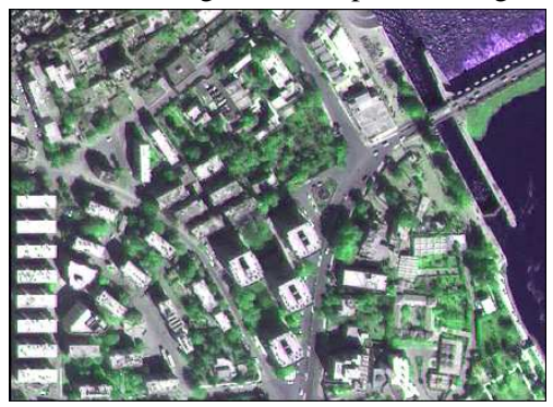
d. Merged image using PCA technique

b. Part of the original multispectral image