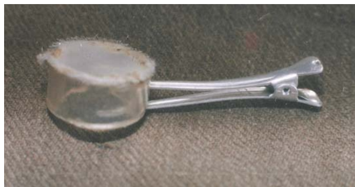
Fig. 1: clip leaf cages, described by (Watson and Dixon,1984) and designed by Abd EL-Wareth (2005)