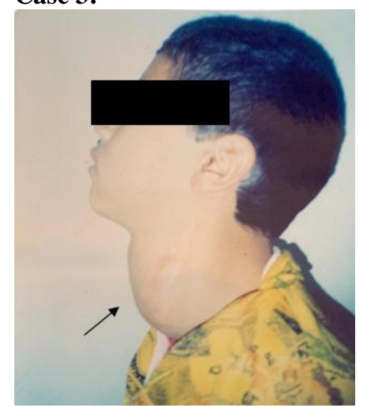
Figure 3 A