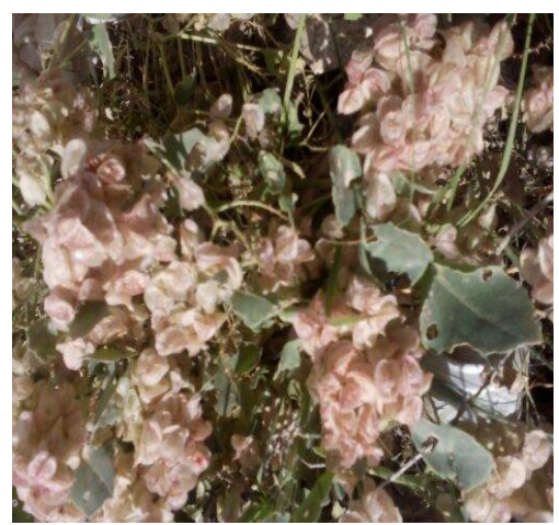
4- Rumex vesicarius L