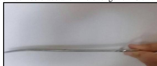
Curved Mayo Scissors.

Arm (C) : Women allocated to this group had episiotomy cut by curved Mayo scissors with 5cm curved blade and whole length of 18 cm.