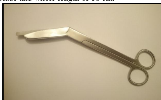
Braun Stadler Angled Scissors.

outcomes are objective and unlikely to be biased by lack of blinding. First stage of labour was managed according to Ain Shams maternity hospital normal labour protocol by continuous monitoring maternal vital signs, assessment of cervical dilatation, effacement, station, position, presentation, fetal cardiotocography and maternal hydration. When cervix was fully dilated, the patient was transferred to delivery room to start the management of the second stage of labour. The patient was placed in the lithotomy position with legs hanged in stirrups and encouraged to bear down during uterine contractions and rest between them until crowning. Local anesthetic of 10 ml Lidocaine 1% (Debocaine® by Sigma company, Cairo, Egypt) was injected at the mucocutaneous junction and testing of loss of pain before episiotomy cutting. Mediolateral episiotomy was cut by scissor at 60 degree angle towards the greater tuberosity. The selection of the type of scissors was according to the designated arm randomly selected Arm (A): Women allocated to this group had episiotomy cut by Braun Stadler angled scissors, which have a 4 cm straight blade and whole length of 18 cm.