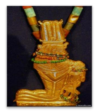
Fig. 7: A beaded necklace made out of gold representing Rennutet suckling the king in the form of Nepri. Tutankhamun, 18<sup>th</sup> Dynasty, New Kingdom. Egyptian Museum.

geographical manifestations as a symbol of welfare and growth; may be the full breast refers to that he carries the double traits of masculinity and femininity, i.e. fertility and vegetation growth. On this view, Nepri's body was covered with wheat (Marwan, 1989).