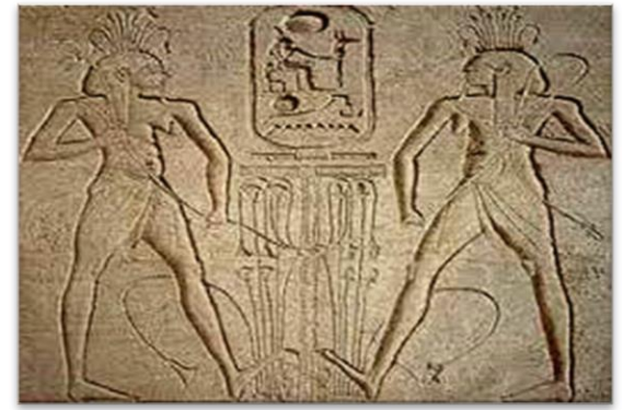
After: Ritner, The Libyan Anarchy: Inscriptions from Egypt's Third Intermediate Period , 517. Osiris \overset{\bigcirc}{\longrightarrow} \overset{\frown}{\longrightarrow} ( Wsir) deity of the grain

Fig. 1: Hapy deity of Upper and Lower Egypt. Temple of Ramsses II at Abu- Simbel, New Kingdom.