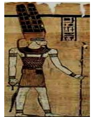
Fig. 5: Amūn in a human form. The Great Harris papyrus, 20th Dynasty, British Museum.

After: Hart, The Routledge Dictionary of Egyptian Gods and Goddesses, 13.