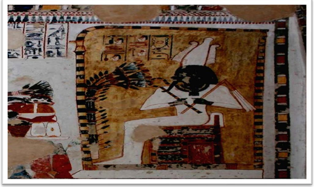
Fig. 2: Osiris, his flesh is green. Tomb of Menna, TT 69 at Sh. Abd El-Qurna, Thutmosis IV to AmenhotepIII, 18<sup>th</sup> Dynasty, New Kingdom.

After: <u>https://osirisnet.net/dieux/osiris/e_osiris_01.htm</u>. Last accessed on 17<sup>th</sup> March 2020. Min '' Win '' deity of fertility