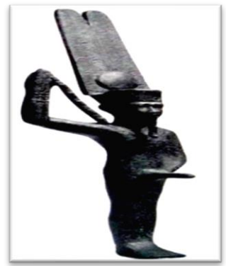
Fig. 3: Bronze figurine of Min. Late Period, Egyptian Museum.

After: Wilkinson, The complete Gods and Goddesses of Ancient Egypt, 115.