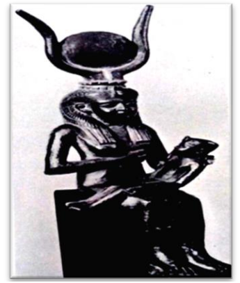
Fig. 4: Bronze statue shows Isis suckling her son Horus. Late period, Berlin Museum.

After: Georges Posener, A Dictionary of Egyptian Civilization, 1st ed. (London, 1962), 24.