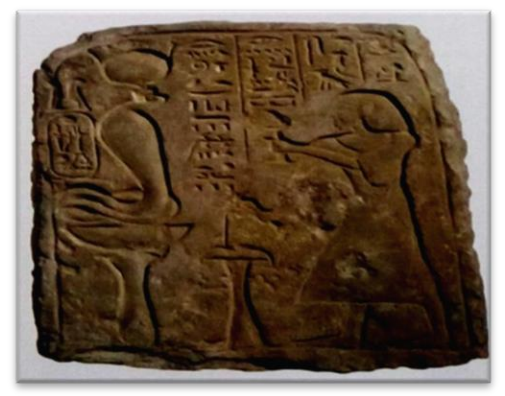
Fig. 11: Limestone stela showing Setau, the viceroy of Kush pouring libation before Rennutet. Buhen, Ramsses II,19<sup>th</sup> Dynasty, New Kingdom, H. 50 cm.

After: Shaw and Nicholson, The Dictionary of Ancient Egypt, 245.