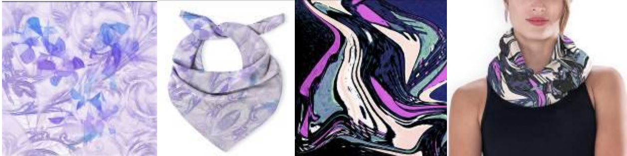
The Blue & violet designs with its implementation in fashion

Applying blue & violet on our neck will affect the liver organ, and this organ is related to the anger emotion according to TCM. So those cool colours will trigger us to be cool and calm down. And we can apply it with a yellow colour on the back and the back of the knee. As yellow colour stimulate self-esteem, cheerfulness & mental clarity.