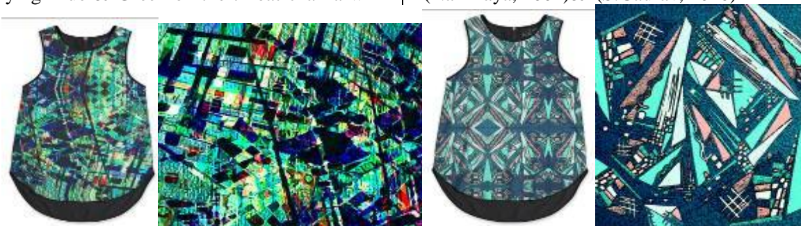
The Blue & Green designs with its implementation in fashion

affect lungs, and the lungs are associated with grief and sadness. Those cool colours providing relief from tension and evoke positive emotional responses. The blue colour will let us feel happiness & peace. While green the master of all colours will trigger stress reduction & balance. (Naz Kaya, 2004)& (S.Gaurav, 2010)