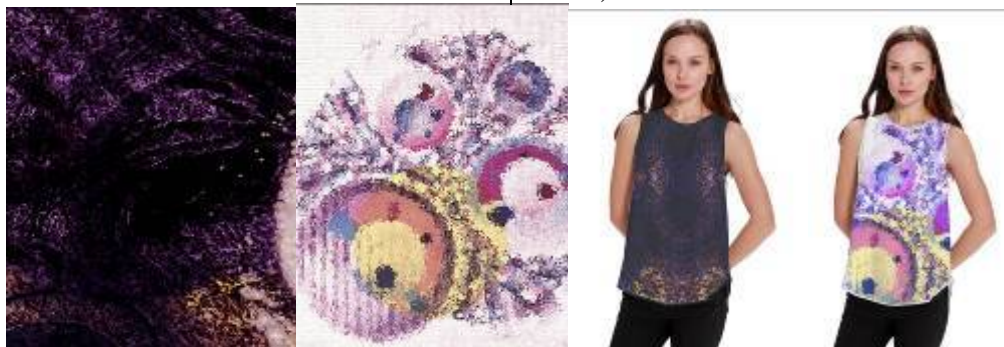
The Indigo designs with its implementation in fashion

So applying indigo on the spleen centre can purify this place and kill bacteria, then we have to apply yellow-orange over the solar plexus zone and blue on the lower back. (Chiazzari.) & (S.Gaurav, 2010)