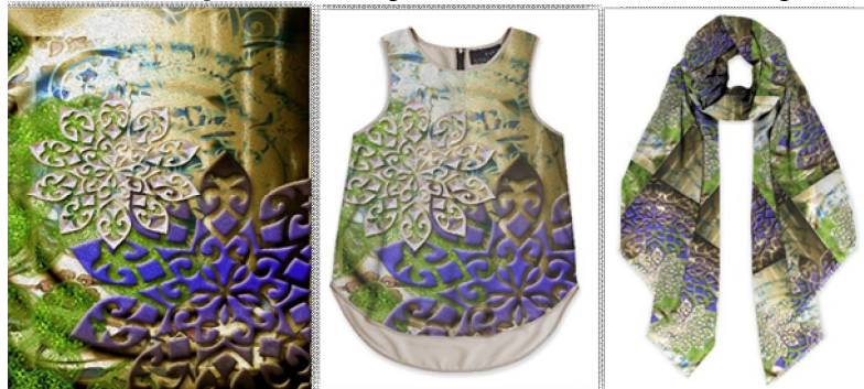
Fall Design (2) & the implementation in the fashion design