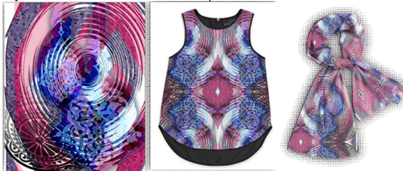
Summer Design (1) & the implementation in the fashion design

while in the second design the overlapping in colours and shapes is so clear and we can feel the semi-transparency in shapes and colours, the soft neutrals control the design.