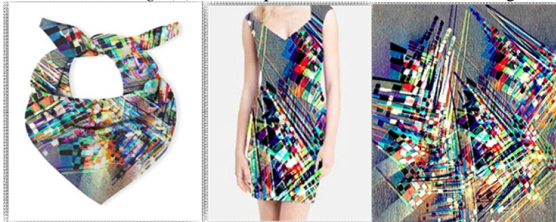
Summer Design (2) & the implementation in the fashion design