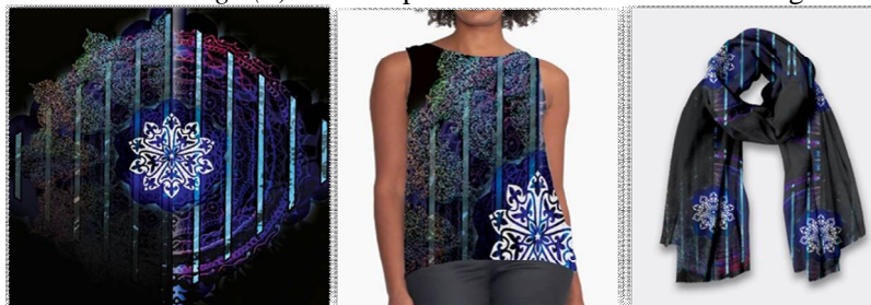
Winter Design (2) & the implementation in the fashion design