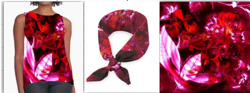
Winter Design (1) & the implementation in the fashion design

It is a season with less daylight, colours are best to be cool, deep and bright, organic shape dominate in the first design, while Islamic motifs overbear in the second design.