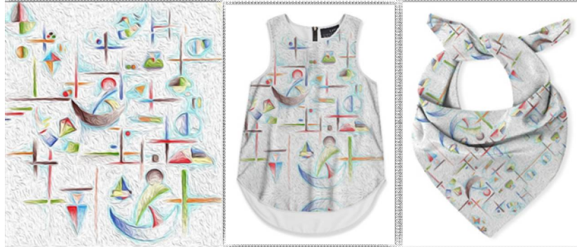
Spring Design (2) & the implementation in the fashion design