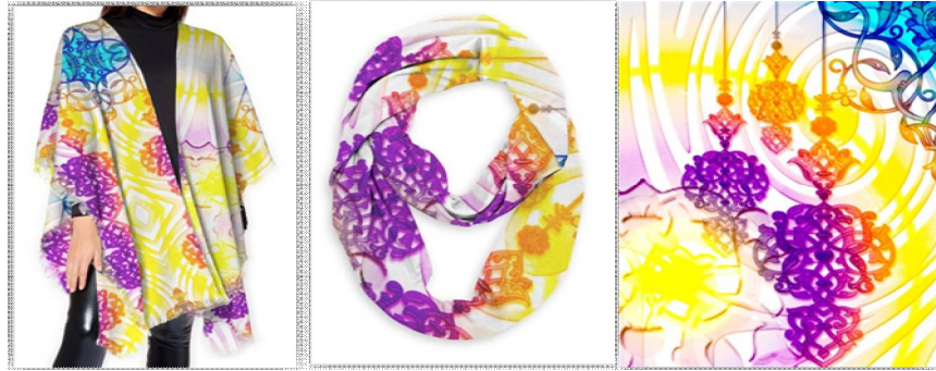
Spring Design (1) & the implementation in the fashion design

geometric shapes dominate we the texture of oil colours, both designs present the light and crisp clear warm colours.