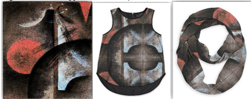
Fall Design (1) & the implementation in the fashion design

outlook. In the second design the Islamic ornament motif dominates with muted, clear, rich and warm colours.