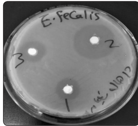
Fig. (2): Antimicrobial susceptibility testing for the three obturating materials by agar diffusion method against E. faecalis . Obturating materials numbering were; (1) ZOE; (2) Endoflas, and (3) Metapex.