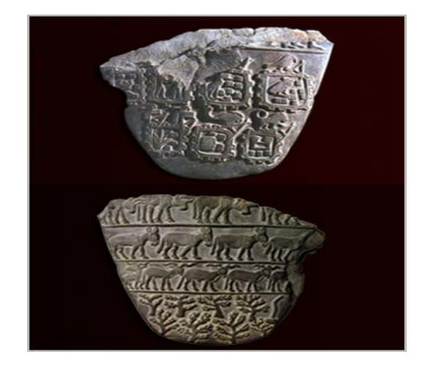
Figure 1: Fragment of The Thehenu palette "Libyan Tribute" tablet End of the predynastic period (3000 BC CA)

reference to Libyan name 'Thehenu' is found on a sign on King Scorpion's statue, from Abydos. It is concluded that Scorpion had some battels with those people during his war to unify Egypt (El-Mosallamy, 1986). The main source of the Libyans is the Libyan Palette or The Thehenu palette (Figure 1), now in the GEM Museum. At the end of the last row of the fourth register, there is a representation of a hieroglyphic sign of a throwing stick on a piece of land, which stands for t3-tmhw, Thnw, Tjehenw the name of the Libyan tribe. Olive trees are one of the main trees that had been grown in Libya. the hieroglyph of the throwing stick on an oval (which means 'region', 'place', 'island'), thus a toponym of Libya or Western Delta. From the scenes on this palette, one can see the tributes of the peoples of Libya to Egypt (bulls, donkeys, rams, olive trees).