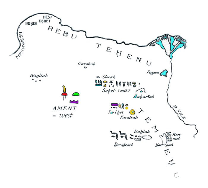
Figure 4: The land of the Temehu tribe in ancient Libya extends all the way to the Nile. According to Herodotus Libya began west of the Nile.

Classical sources from Herodotusonward recognize name of tribes and other groups, but provide no clear culturally characteristic categories and descriptions(Figure 4). Cultural diversity is almost probable due to the topographical range of the area of the Libyan tribes in the historical records is immense and varies ecologically.