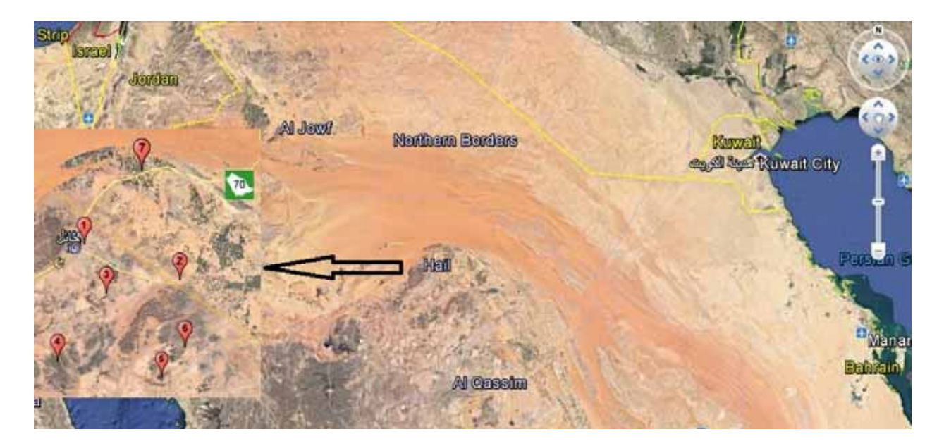
Fig. (1): Saudi Arabia and Location of farms in the Hail Region at the left

avoid the adsorption of radionuclides on the walls of the container and growth of micro-organisms, and transferred to polyethylene bottles. The soil samples were collected from the cultivated area using a template for guidance to 25 cm<sup>2</sup> area and a depth of 15 cm. Three sub-samples were collected at each point and mixed thoroughly to produce a homogeneous representative sample, packed in plastic bags and transferred to the laboratory. The soil samples were oven-dried at 100°C to a constant weight, homogenized, sieved through 2 mm mesh sieve, packed into 100 mL standard plastic containers and sealed for four weeks to allow secular equilibrium between <sup>226</sup>Ra, <sup>228</sup>Ra and their decay products. The crops samples were collected from the soil sampling points, packed in plastic bags. In the laboratory, they were cleaned from soil particles, weighted, oven-dried at 105°c, reweighted, packed and sealed in Marinelli-type beakers for analysis.