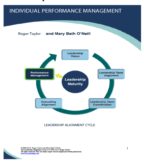
Fig (3) performance management [20].