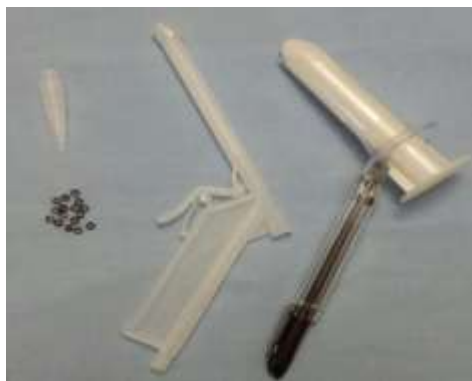
Fig (2) A disposable suction rubber band ligation set.