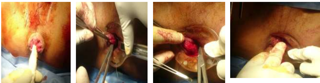
Fig (3) Manual hemorrhoidopexy.

under run the hemorrhoidal vessels and incorporate the mucosa, submucosa and a piece of the inward muscle layer. It was ligated to go about as a fixed beginning bunch. This stitch was proceeded as a running line for a further three or four join chomps ending over the dentate line. The terminal stitch end was ligated to the principal bunch to deliver a lifting of the prolapse and a repositioning of the dentate line up set up. The technique was applied to all prolapsed hemorrhoids primarily at 3, 7 and 11 O'clock in lithotomy position. A dressing swab was brought into and expelled from the butt to check whether the prolapse has been totally settle.